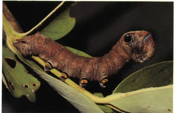
Fig. 1-2. Larva of Madoryx pseudothyreus feeding on black mangrove: 1) lateral view showing abdominal segments 3-4 not being used; 2) the defensive posture.