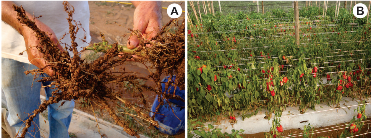
Fig. 1. Root systems of the F 1 hybrid Snooker infected by Meloidogyne enterolobii in production area of Taquara (Central Brazil), 2014. Affected plants displayed necrosis accompanied by a profuse production of galls (A). The above-ground symptoms were characterized by an overall yellowing, severe wilt and premature defoliation (B).