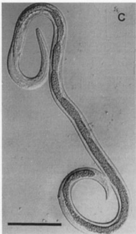
Fig 1. A) Nothofagus obliqua leaf with numerous galls induced by a new anguinid nematode species. B) Large population of the nematode extracted from a single gall, containing all life stages. C) Female of the nematode. (Scale bars in \mu\text{m} : 25 in A; 250 in B; and 100 in C).