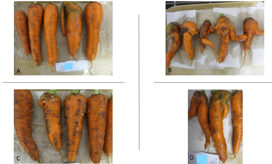
Figure 1. Carrot quality (Marketable vs. unmarketable (forked and rotten)) of randomly collected carrots at site 1 (A), site 2 (B), site 3 (C), and site 4 (D).

significantly higher at site 1 compared with site 4. MI25 was significantly higher at site 1 compared with sites 3 and 4. Similarly, MI25 was significantly higher at site 2 compared with site 4.