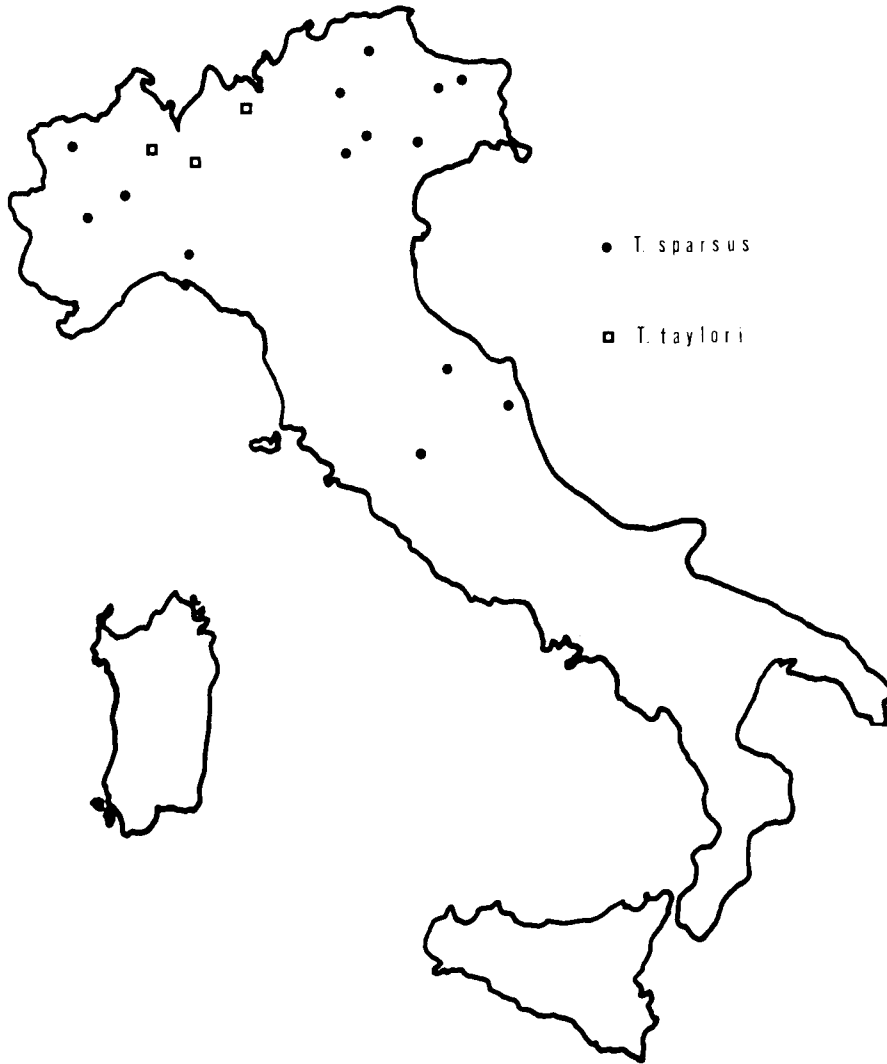
Fig. 2. - Geographical distribution of T. sparsus and T. taylori sp. n. in Italy.

minal cuticle thickened, with a pair of post-cloacal subventral papillae and a pair of subterminal pores (Fig. 1F).