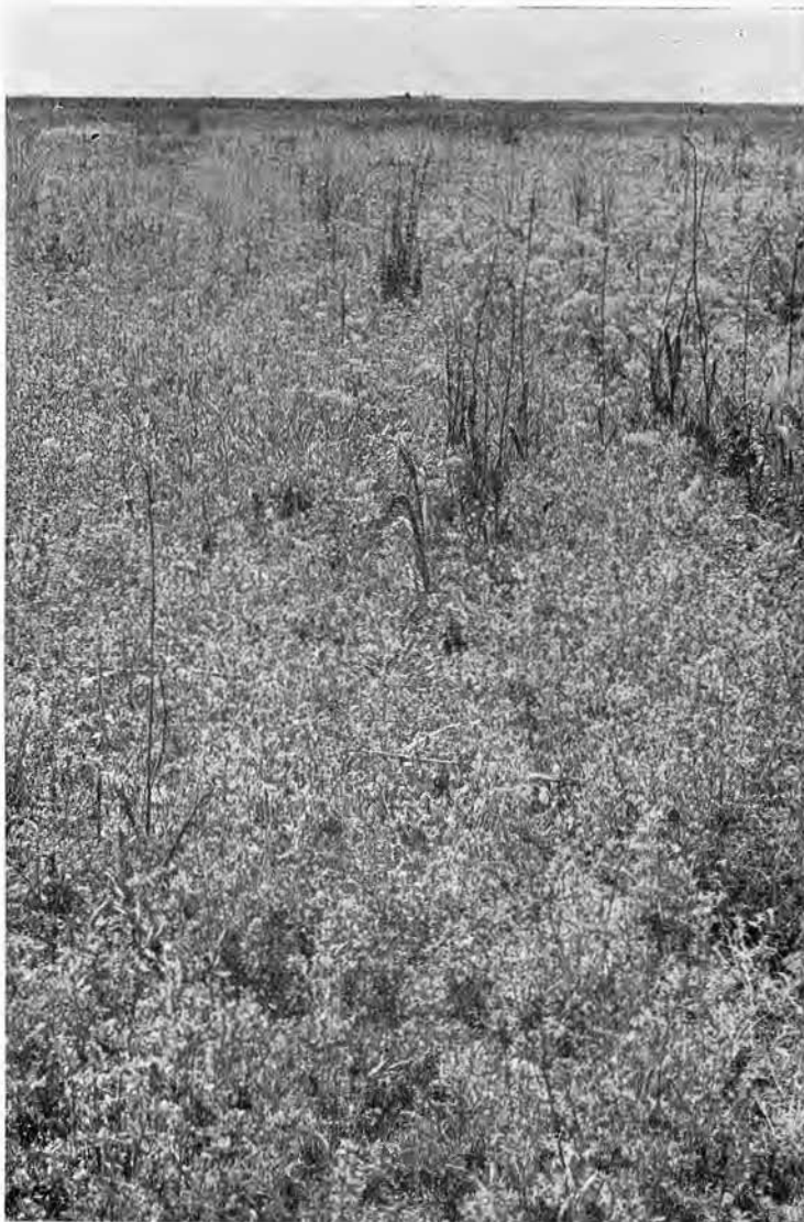
Fig. 1 - The alfalfa field heavily infested with the stem nematode, showing weeds dominating the alfalfa plants.