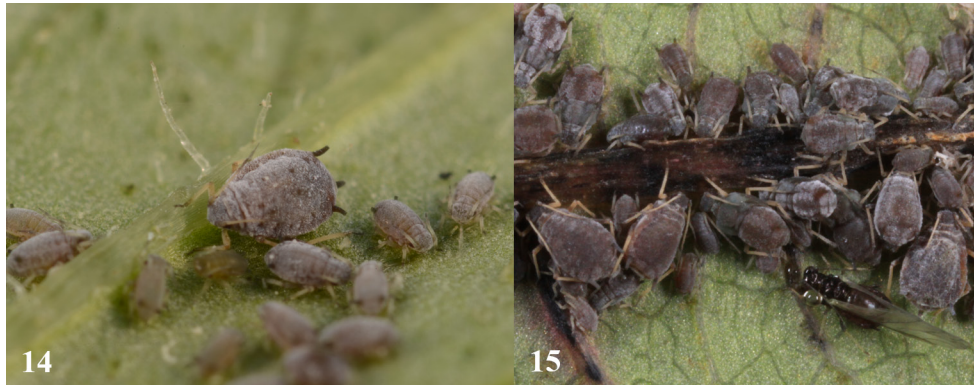
Figures 14–15. Colony of Aphis impatiensis. 14) On Erechites hieraciifolius. 15) On Impatiens capensis.