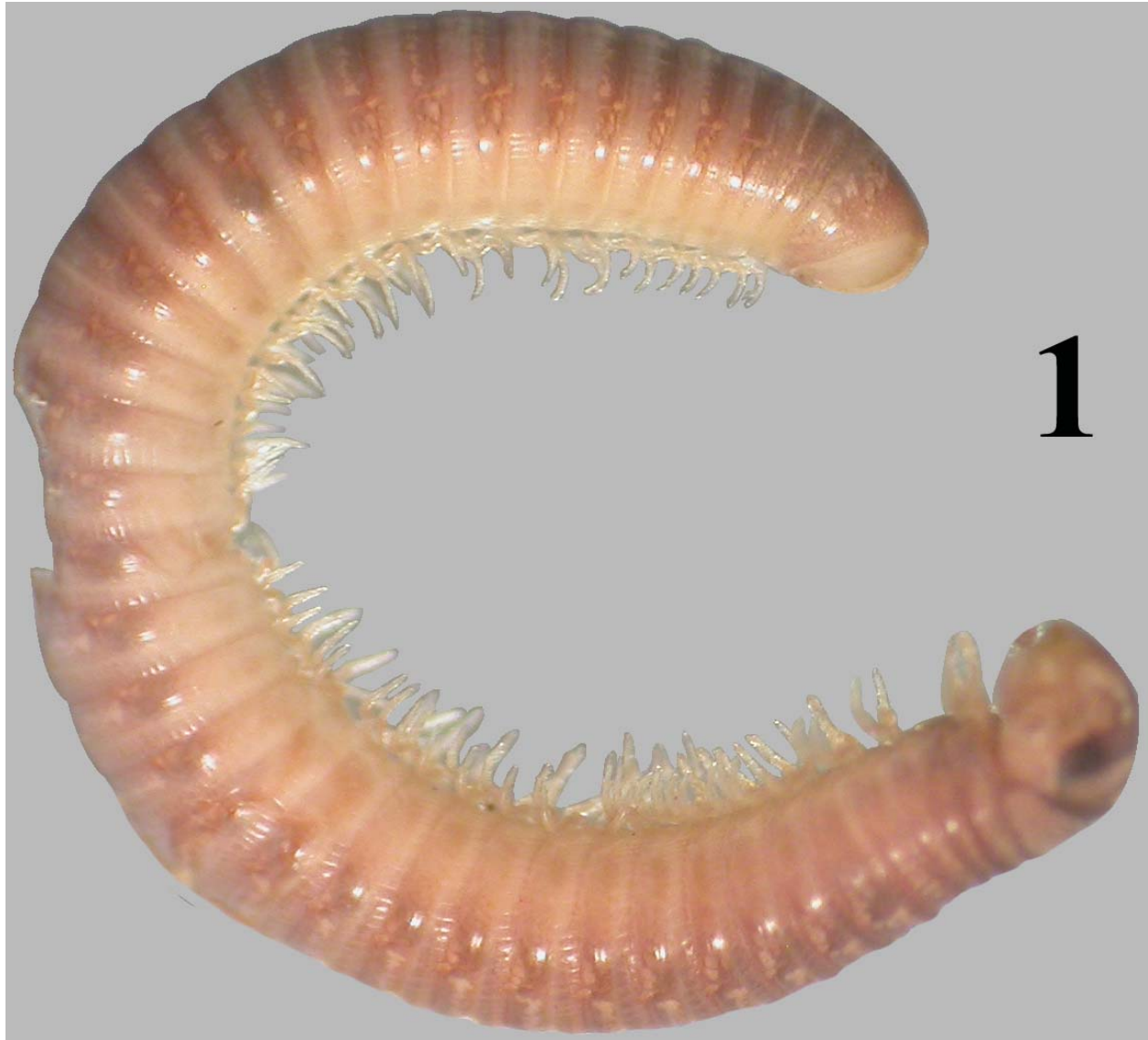
Figure 1. Lateral view of left side of the Patagonian cylindroiuline julid; damaged section caused by handling with forceps.

and citations. All are from southern South America, particularly Chile, and occurrences are depicted in Fig. 4. More surely exist, but some better known and important works, like that of Carl (1914) on Colombia, lack them. Most records appear under old or archaic names that we also cite. Sources for modern names are Blower (1985) and the Fauna Europaea website ( http://www.faunaeur.org/ ); taxonomy is per Hoffman (1980), Enghoff (1990), Shelley (2003), Enghoff et al. (2011), and Shear (2011).