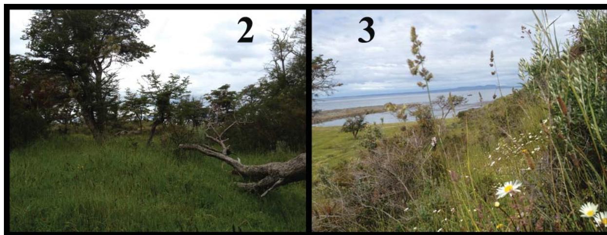
Figures 2-3. Habitat at Puerto de Hambre. 2) Wet wooded grassland similar to where the milliped was discovered; the trees are Nothofagus ?betuloides . 3) Dry shrubby grassland on slope leading to the Strait of Magellan, adjacent to the wetter site where the milliped was collected.

Brazil in general (Schubart 1946, Blower 1985, Korsós and Enghoff 1990). São Paulo State in general (Schubart 1963); São Paulo, Departamento de Botânica da Universidade de São Paulo (Schubart 1946, 1947).