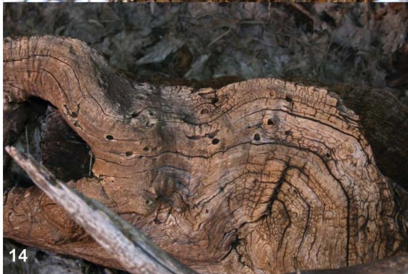
Figures 12–14. Gambel's oak ( Quercus gambelii ) containing X. rameyi .