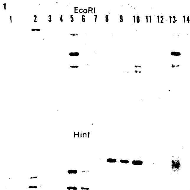
FIG. 1. Purified mtDNA digested with EcoRI (top half of gel) and HinfI (bottom half). MtDNA was hybridized with the cloned 1.8-kb HindIII fragment from M. incognita . Meloidogyne isolates are M. arenaria (lanes 1-6), M. javanica (lanes 7-11), and M. incognita (lanes 12-14).

Nematode isolates: All nematodes were maintained on greenhouse-grown tomato ( Lycopersicon esculentum L. cv. Rutgers). Each of these isolates has been characterized wholly or in part by host range (5), perineal patterns (5), or esterase phenotype (4), and each is consistent with the specific designation. Original isolations are presented in Table 1.