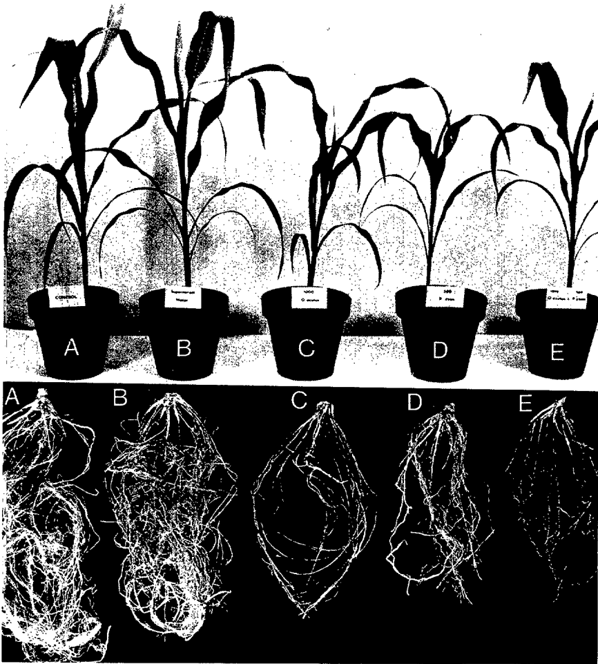
FIG. 2. Shoot and root growth of sorghum plants in a greenhouse after 6 weeks in various soil treatments. A) No nematodes. B) Nematode-free filtrate (2.5 ml/pot). C) 1,000 Quinisulcius acutus per pot. D) 500 Pratylenchus zae per pot. E) 1,000 Q. acutus plus 500 P. zae per pot.

Plant height and fresh and dry top and root weights were suppressed ( P = 0.05 ) by all nematode treatments (Table 3). There were no differences in plant growth responses between inoculations of 1,000 Q.