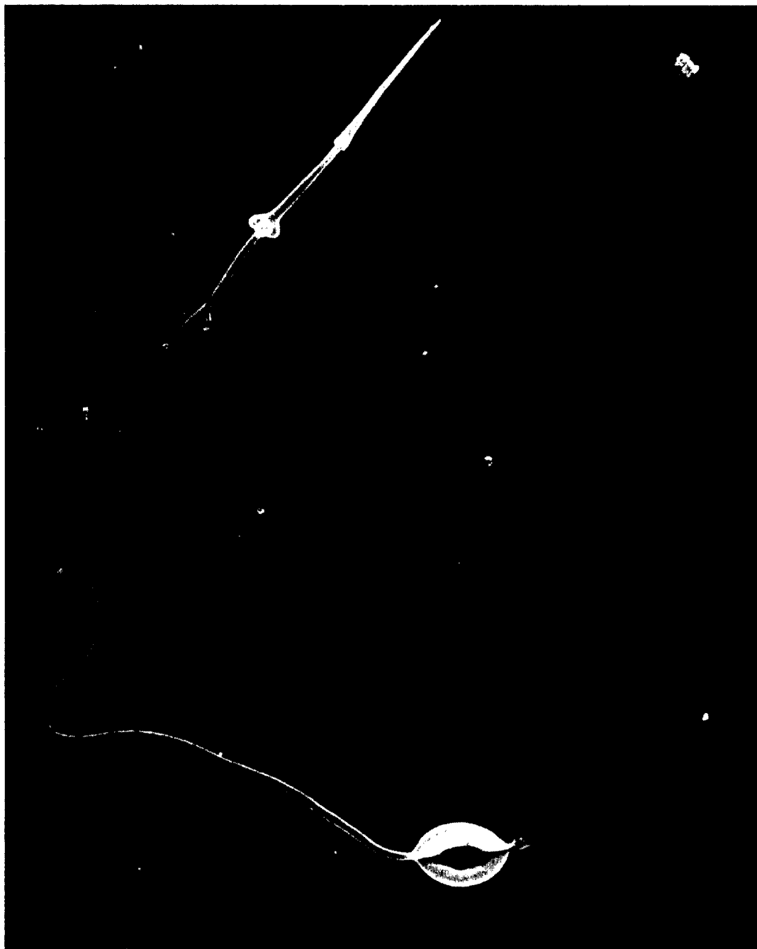
Fig. 2. SEM photograph of an excised stylet and attached cuticular lumen lining of the esophagus of a Meloidogyne hapla second-stage juvenile.

and flexible. The branched orifices of the subventral glands are located immediately posterior to the enlarged lumen of the median bulb. The lining of the posterior part of the metacarpus and isthmus is very thin.