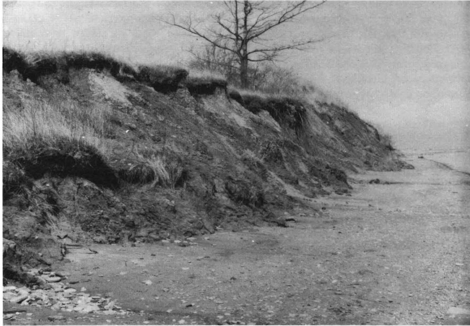
Figure 2. Photograph of the beach and bluff just east of Fifty Point taken in July, 1981.

and spatially. In an attempt to incorporate all the effects of sediment cover, and to determine the best predictor(s) of its role in controlling recession rates, three different measures were used.