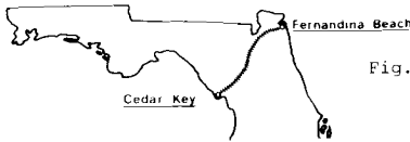
Fig. 3 The Florida Railroad

nandina Beach on the east to Cedar Key on the west was the most important (Cedar Key State Museum). Yulee lobbied vigorously before the Florida legislature, arguing that Cedar Key was the logical selection for the Gulf Coast terminus. In comparison with the competing possibilities, Cedar Key had a better harbor, the shortest rail connection between coasts, less expensive shipping costs to New Orleans, and proximity to the 5,100-acre sugar plantation on Tiger Island on the Homosassa River (which, incidentally, Yulee owned) (Fishburne 1982e, p. 3).