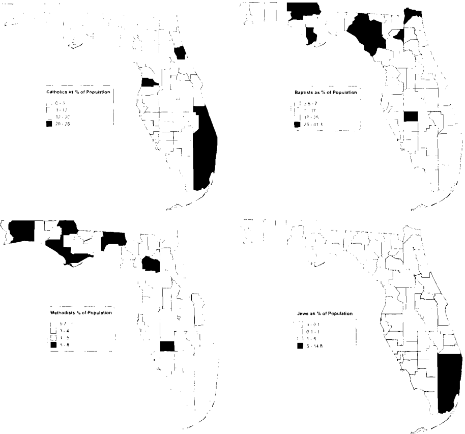
Figure 2. Catholics, Baptists, Methodists, and Jews as percentages of county populations.