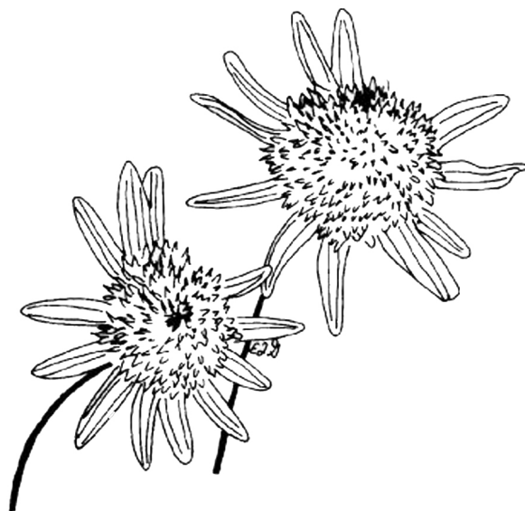
Figure 1. Pincushion flower

Planting month for zone 9: Apr; May; Jun; Jul; Aug; Sep