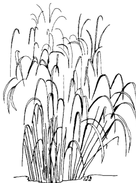
Figure 1. 'Zebrinus' Japanese silver grass

Plant type: herbaceous; ornamental grass