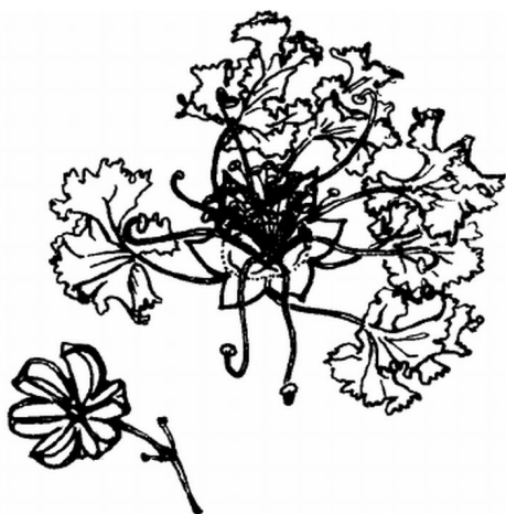
Figure 3. Flower of 'Yuma' crape myrtle

Trunk/bark/branches: showy; no thorns; can be trained to grow with a short, single trunk