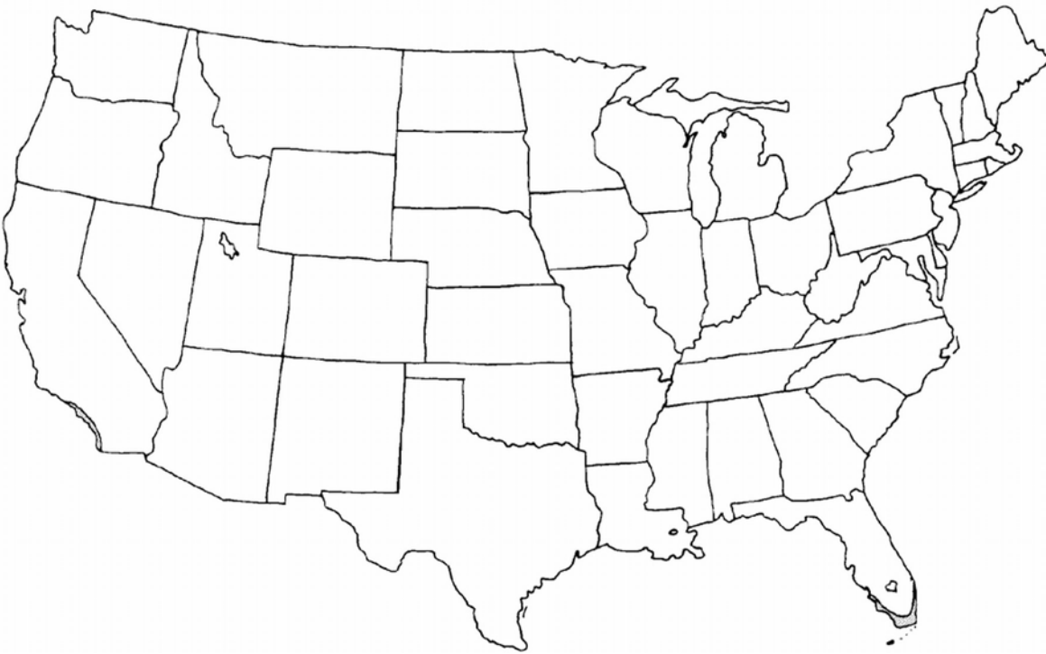
Figure 2. Shaded area represents potential planting range.