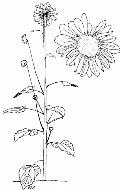
Figure 1. 'Sonja' Sunflower.