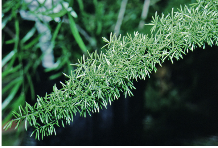
Figure 2. Leaf— Asparagus densiflorus 'Myers': 'Myers' asparagus fern.