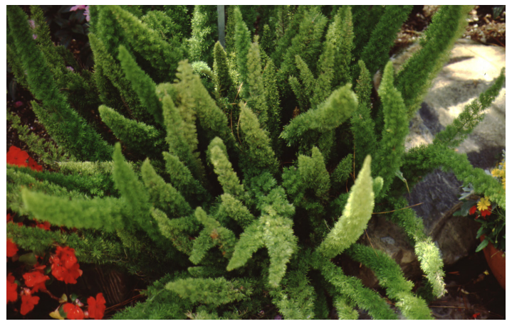
Figure 1. Full form— Asparagus densiflorus 'Myers': 'Myers' asparagus fern.

'Myers' asparagus fern is a spreading perennial herb that has a fine texture with a stiff, upright habit. The habit is quite unlike that of the more common 'Sprengeri' fern. This plant grows fairly rapidly and may attain a height of about 2 feet. The true leaves of this fern are scale-like and inconspicuous. The structures that most consider to be the leaves of this plant are actually narrow, light green, leaf-like branchlets called cladophylls. The stems of the asparagus fern emerge directly from the ground and are stiffly erect and have very short branches. These stems are a bit woody and are often armed with sharp spines. The flowers are white or pale pink and occur in axillary racemes that are <sup>1</sup>/<sub>4</sub> inch long; they are not showy. The bright red berries of this herb, however, are quite showy.