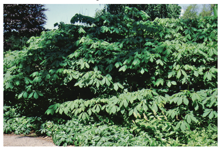
Figure 1. Full form—Aesculus parviflora: bottlebrush buckeye.

Native from Alabama and South Carolina into Florida, bottlebrush buckeye forms a rounded mass of dark green, palmately compound foliage in mid-spring (Figure 1). The shrub eventually reaches about 8 feet tall but grows to 12 feet wide. It can be found in its native, moist, shaded habitat flowering in early summer. The delicate, showy, white flowers are held well above the foliage in terminal panicles up to 12 inches long. Bottlebrush buckeye has been successfully used as far north as Chicago (hardiness zone 5).