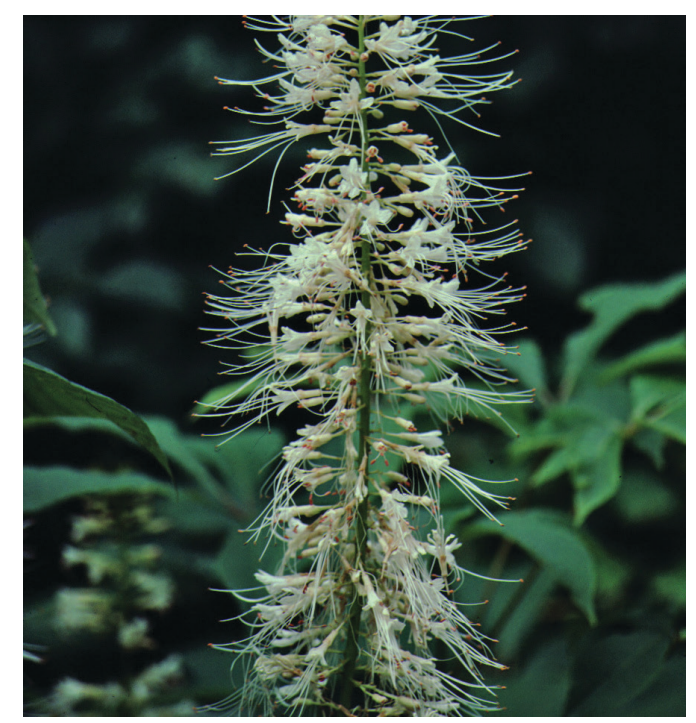
Figure 4. Flower— Aesculus parviflora : bottlebrush buckeye.