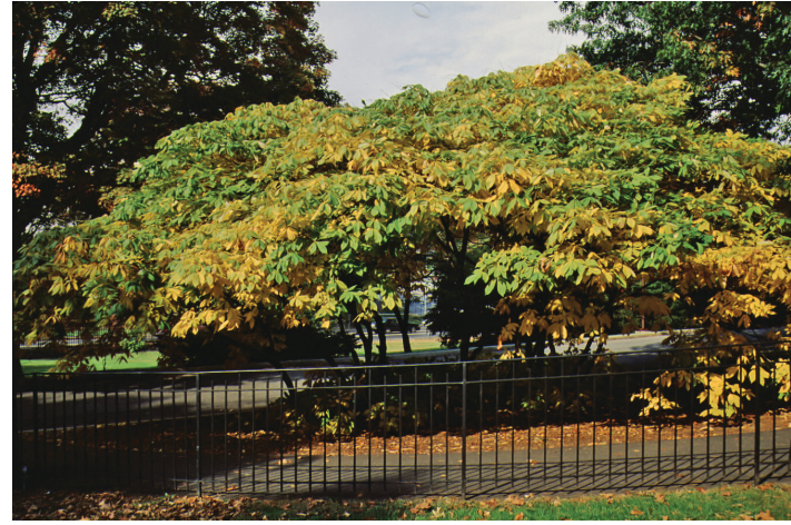
Figure 2. Full form, fall color— Aesculus parviflora : bottlebrush buckeye.