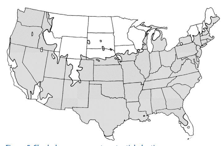
Figure 5. Shaded area represents potential planting range.