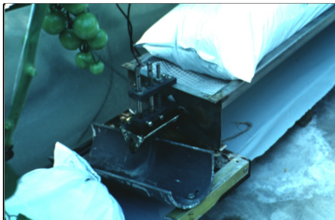
Figure 3. Starter tray for scheduling irrigations for perlite or rockwool systems.

To avoid this type of problem, the automated watering in rockwool systems uses a “starting tray” irrigation sensor (Fig. 3).