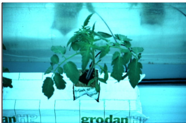
Figure 2. Media for this tomato plant is wrapped in polyethylene to minimize contamination of the root system.

Perlite, peat bag, and rockwool systems are not "closed circuit" systems as in hydroponics. One to several plants grow in each bag or slab and many individual bags or slabs are used in each greenhouse.