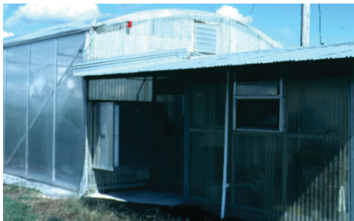
Figure 3. “Airlock” entrance porch to minimize entry of pests into greenhouse.

Greenhouses should be built with an “airlock” entrance design (Figure 3). This entrance porch prevents direct ingress of wind, insects, soil, and spores into the greenhouse. Such an entrance has the additional advantage of making doors easier to open and close when the fans are operating. The double entrance also prevents short-circuit air flow patterns when ventilation fans are in operation.