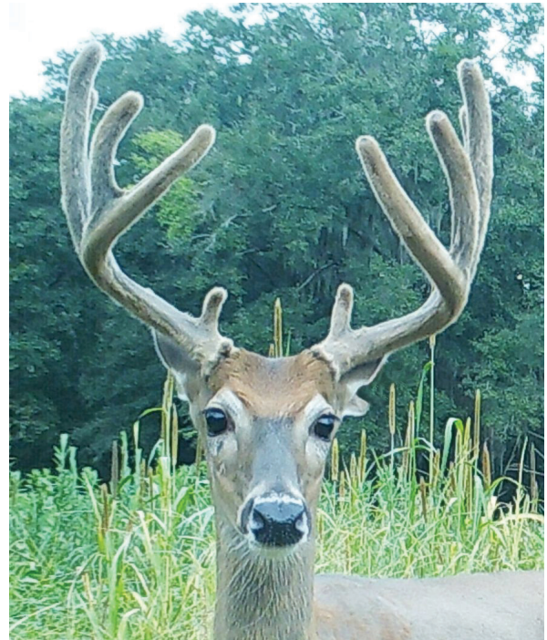
Figure 1. White-tailed buck with antlers still in velvet.

Antlers grow, shed, and regrow in cycles every year. Typically, growth will begin in mid- to late spring, starting from the pedicle, or base, of the antlers. New growth is covered in velvet, a soft, hair-like tissue that provides oxygen and nutrients to the growing antlers. This velvet remains on the antlers until the end of summer. At this time, which coincides with the breeding season, the velvet will shed and leave behind hardened, bony antlers. Deer will keep their antlers through fall and most of winter, after which they will shed by early spring and restart their cycle.