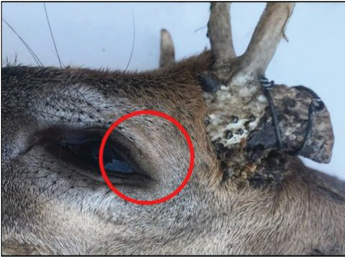
Figure 3. This picture shows a deceased white-tailed deer with an antler infection. The infection site is highlighted with a red circle.