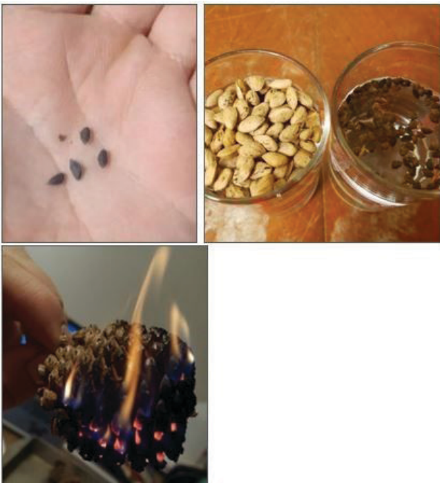
Figure 7. Left, pond pine seed size relative to a hand; center, paler and much larger longleaf pine seeds in comparison to pond pine seeds; right, a pond pine pinecone being burned to release the seeds.

Pond pine is readily propagated by seed (Figure 7) that can be collected from mature unopened cones. Mature cones with viable seeds are brown or deep brown, not green. To open the cones carefully crush them with a metal vice or expose them to dry heat of 167°C to 169°C (333°F to 336°F) for 30 seconds. A light application of fire is also effective to burn off the resin encrusting the cones and allow them to release their seeds (Figure 7).