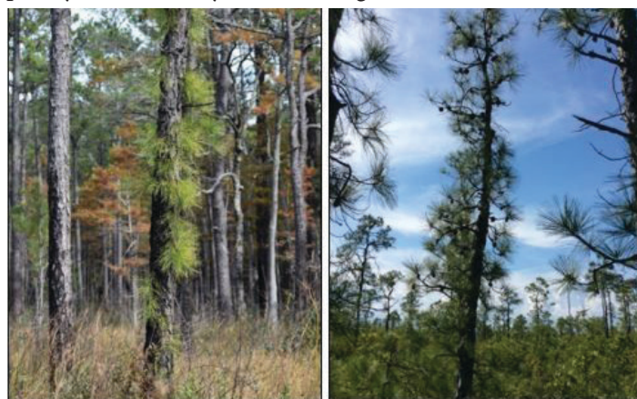
Figure 2. Recently burned pond pine growing in very poorly drained soil.

The species is commonly known as pond pine, marsh pine, bay pine, or pocosin pine because it tends to be found on poorly drained, very wet sites (Figure 2).