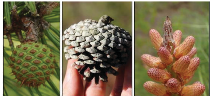
Figure 5. Left, an immature female pond pinecone; center, a mature female cone.

cones (Figure 5). These cones can accumulate in the crown of tree and may remain sealed with viable seeds for up to 10 years (Bramlett 1990). The resin on the cones melts when exposed to fire, which then triggers the release of seeds for wind-borne or gravity dispersal into freshly burned ground. The conditions following a fire present the ample opportunity for young pines to grow (Proctor and Monroe 2019).