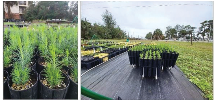
Figure 8. (left) Young pond pines growing at the nursery. (right) The pond pines in cone containers.

in July of 2021, and sown in August of 2021 outdoors due to this species' extreme intolerance to shade (Bramlett 1990). Seeds were sown via light press (i.e., 1 cm or 0.4-inch depth) into a soil substrate of peat, perlite, and vermiculite at a 5:3:2 ratio. We used D60 pots manufactured by Anderson Pot Company with a cell diameter of 2.5 feet (about 75 cm) and a depth of 14 inches (about 35 cm). Of the 250 seeds planted, 176 seeds germinated (70% germination rate). Seedlings were fertilized using 1 teaspoon of slow-release pellets of Osmocote Plus 15-9-12 to ensure adequate nutrition. After ten weeks plants averaged roughly 7 inches (18 cm) tall. Plants were then out-planted to the edge of a cypress dome after 16 months and averaged 23.7 in (60 cm) tall at that time.