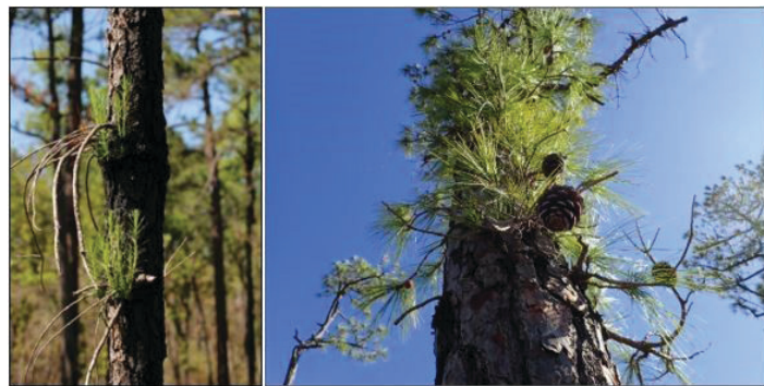
Figure 4. Pond pine epicormic sprouts and female cones.

In Florida, pond pine is typically found on wet or poorly drained soils and within the following plant communities (see the Florida Natural Areas Inventory (FNAI) for more on community descriptions): wet flatwoods, shrub bogs or pocosins, baygall, and along the margins of cypress domes and tupelo swamps (Florida Natural Areas Inventory 2010). In these communities, fire plays an important ecological role in maintaining plant composition (Florida Natural Areas Inventory 2010). As result, pond pine appears to possess many adaptations to fire such as serotinous female