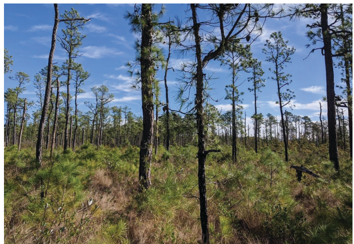
Figure 6. A natural stand of pond pine.

Pond pine has limited commercial value due to a typically crooked trunk and slow growth. It is opportunistically sold for pulpwood and biomass, but its form is rarely straight enough for sawtimber (Figure 6) (Nyoka 2002; Graham and Rebutck 1958). There are no major breeding programs for pond pine, and efforts to grow it in other countries for timber have not been successful compared with other pine species such as loblolly pine ( P. taeda ) and Monterey pine ( P. radiata ) (Nyoka 2002). It is also susceptible to pitch canker disease ( Fusarium moniliforme ) and may experience dieback when infected, but it is more resistant than Virginia pine ( Pinus virginiana ) and slash pine ( Pinus elliottii ) (Kuhlman and Cade 1985).