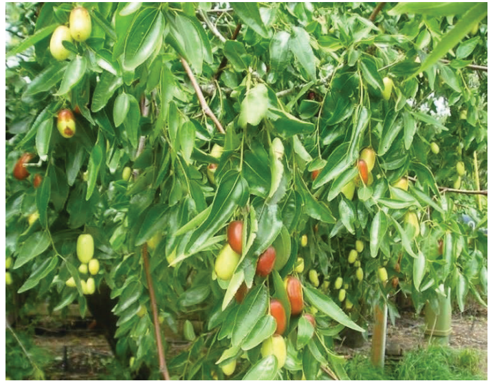
Figure 25. 'Tigertooth'.