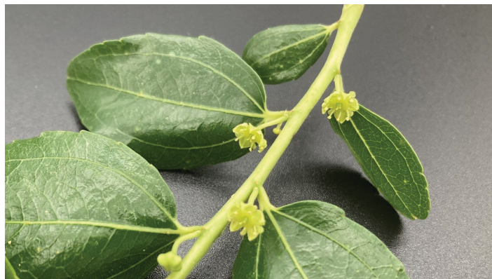
Figure 12. Close-up of jujube flower.

Flowering occurs on fruiting spurs which give rise to a cyme inflorescence bearing numerous, small yellow perfect flowers (5–9 millimeters; Figure 12). Biennial bearing has not been described in jujube.