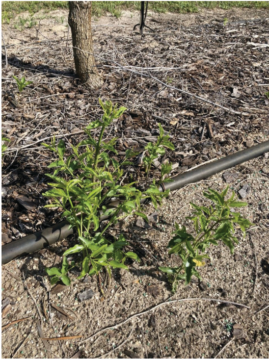
Figure 9. Suckering habit of jujube. Traditionally suckers have been used for propagation.