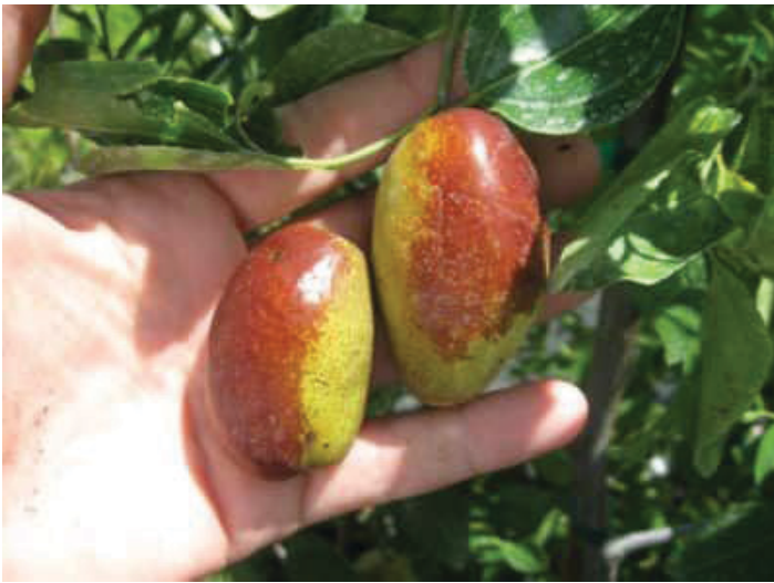
Figure 17. 'GA866'.