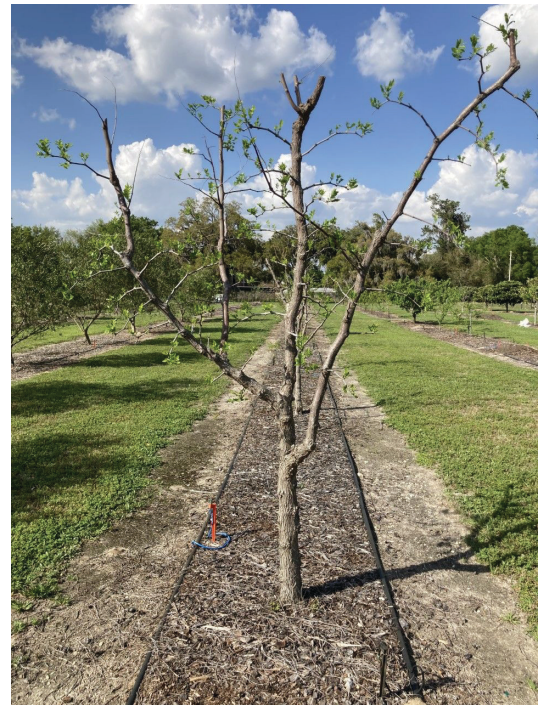
Figure 4. Four-year-old 'Shanxi Li' variety trained as an open center in early March, Gainesville, FL.