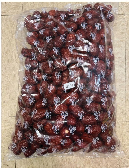
Figure 16. Dried jujube fruit in supermarket.

Jujubes may be dried, with some varieties being more amenable to dehydration than others. Dried fruit have a chewy consistency, with enhanced sweetness. Dried fruit (Figure 16) store well at room temperature and can be stored for several years at 40°F (4°C). Fresh fruit may be