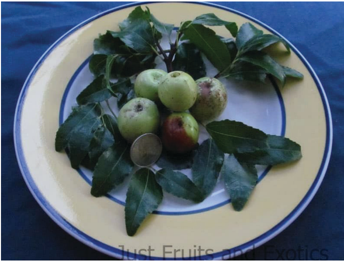
Figure 23. 'So'.