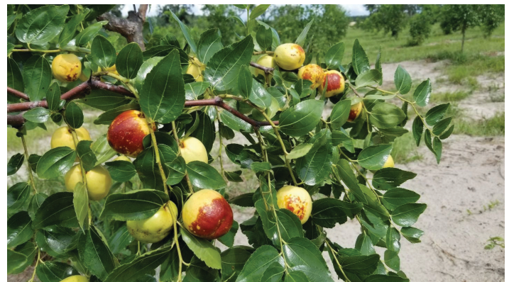
Figure 14. Fruit of jujube borne on new growth.