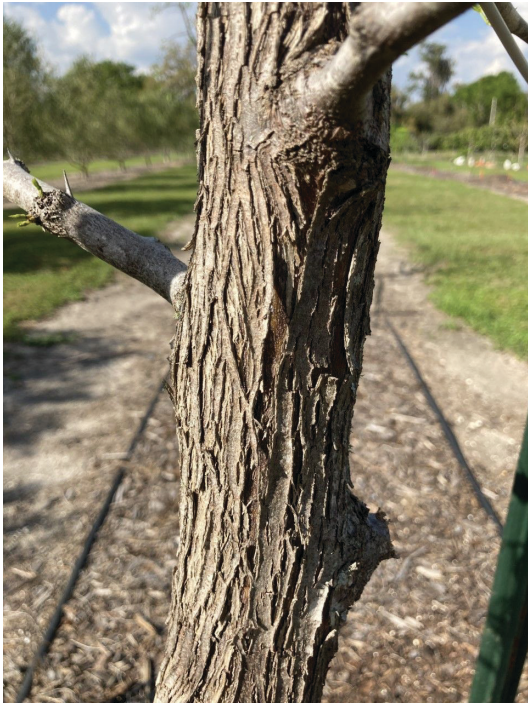
Figure 5. Bark pattern of 4-year-old 'Sugar Cane' variety, Gainesville, FL.