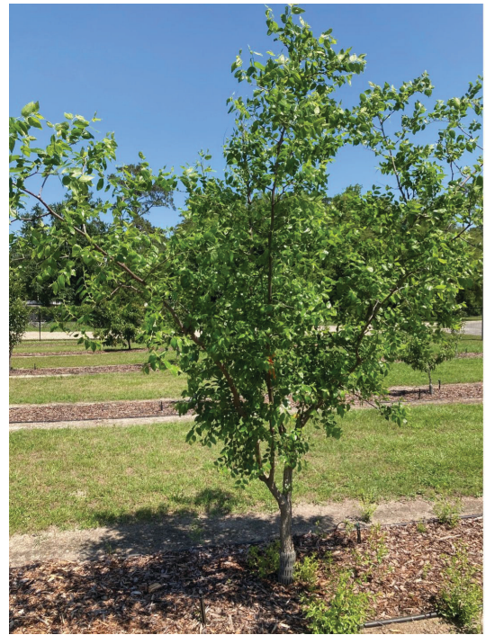
Figure 3. Three-year-old jujube tree trained as an open center, mid-April, Gainesville, FL.