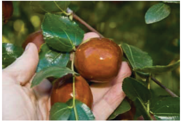
Figure 20. 'Li'.