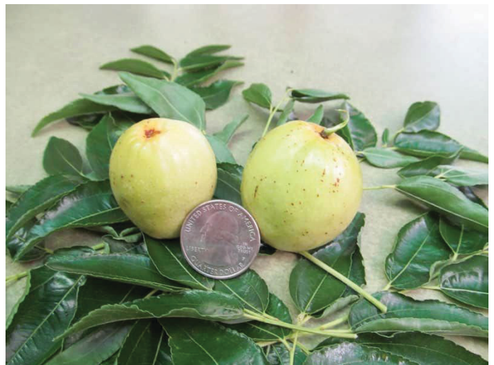
Figure 22. 'Si-Hong'.