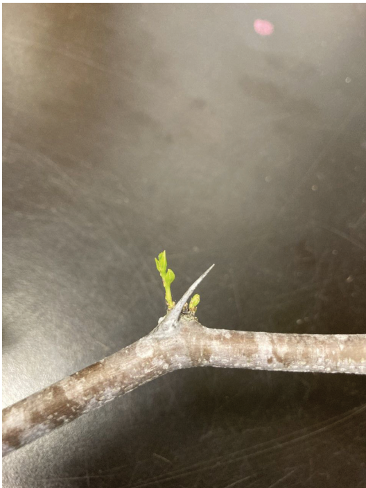
Figure 6. Emerging vegetative buds, protected by adjacent thorn.