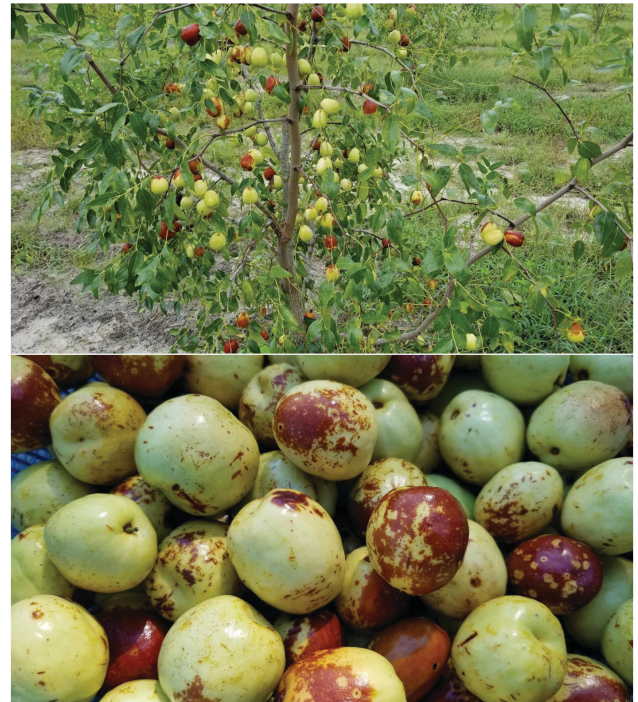
Figure 1. Jujube tree and jujube fresh fruit.

same growth characteristics, so this review applies only to the Chinese jujube.