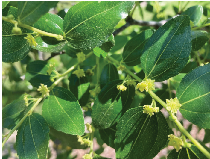
Figure 11. Flowering habit of jujube.

Jujube types may be characterized by the time of day that they flower (Figure 11 and Figure 12), which falls into one of two types. One type is open between 7 a.m. and 10 a.m., the other between 2 p.m. and 5 p.m., and flowering time is acutely affected by weather, especially ambient temperature. There are several reports that detail self-incompatibility in jujube varieties, indicating that several compatible trees must be planted to successfully produce fruit. Pollen is produced approximately 12 hours before the stigma is receptive to pollination, and successful fruit set has been observed between flowering-time types (Figure 13). The exceptions are the parthenocarpic varieties ('Silverhill' or 'Tigertooth', which are likely the same variety; 'Swoboda' or 'Leon Burk'), which are reliable producers albeit with few viable seeds.