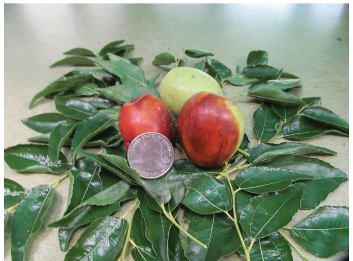
Figure 21. 'Shanxi Li'.