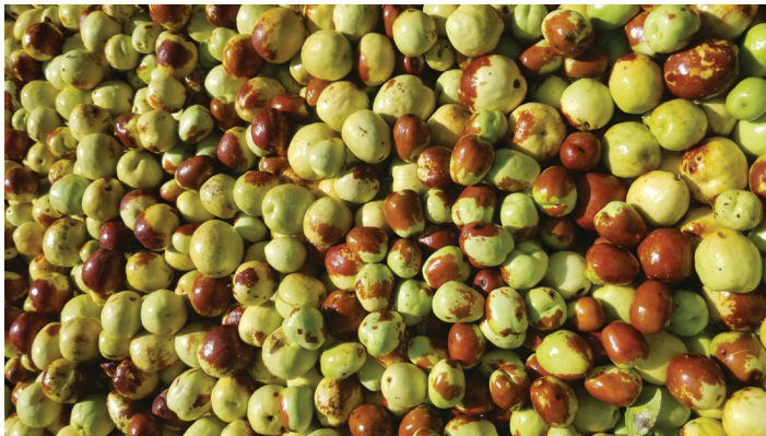
Figure 15. Jujube fruit harvested for fresh market.

The fresh jujube fruit is generally crisp like an apple, with similar texture, but generally not as juicy (Figure 15). The spongy flesh has a flavor reminiscent of apple or Asian pear with sweetness and a tangy aftertaste. The flavor and less-foamy texture improve as the tree ages. The sweetness varies significantly between genotypes (Table 1). Jujube flavor is significantly affected by environmental conditions and management practices, as fruit from any given cultivar have been described from “fruity and aromatic” to “crunchy and foamy” suggesting that genetics are necessary but not sufficient to produce a flavorful fruit.