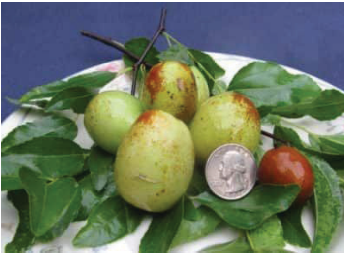
Figure 24. 'Sugar Cane'.