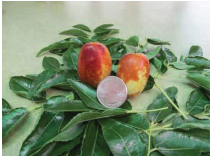
Figure 26. 'Winter Delight'.