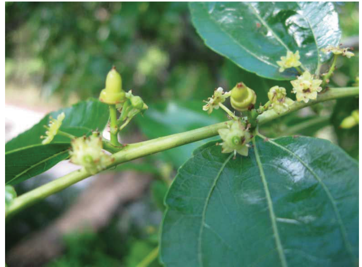
Figure 13. Fruit set in jujube.

Fruits are borne on new growth (Figure 14) and expand through the summer months, typically ripening in August and September in Florida. The fruit is a drupe, containing a pit, with one or two seeds. Fruit size varies greatly among varieties, with 'Tigertooth' being ovate and 1–1.5 inches (2–3 centimeters) in length, to 'Thai Giant' being the size of an extra-large chicken egg. In most varieties, ripening is noted as a change in color from green to brown, yet fruits (peel and pulp) may be consumed fresh from the green to brown stage or dried. Different varieties are more amenable to drying.