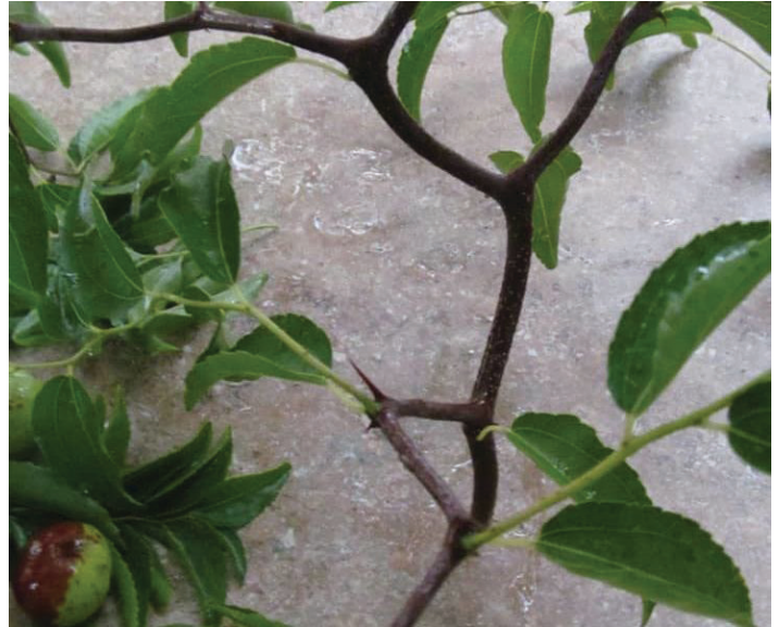
Figure 7. Thorniness with branches growing in a zig-zag pattern is apparent in many jujube varieties.

stratification (cold treatment) in moist peat moss for 90–120 days at 40°F (4°C). Seeds will germinate without stratification but at a much lower rate. Some sources recommend scarifying (to weaken the surface of) seeds manually or with boiling water, followed by cooling for 24 hours prior to sowing. The use of a germination heating pad has been suggested to increase the germination rate.