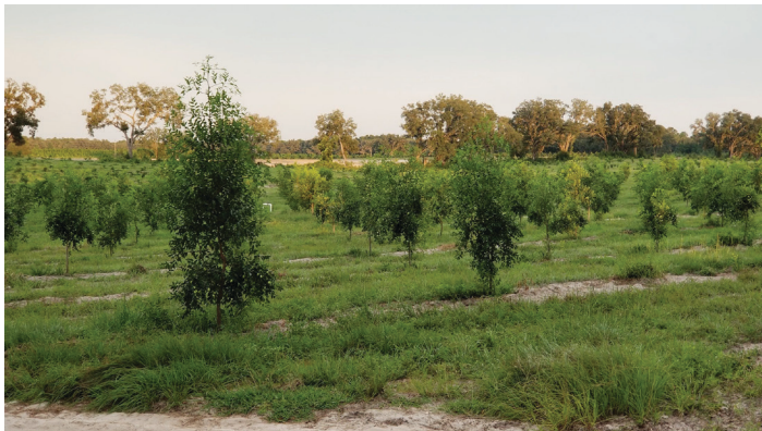
Figure 2. Jujube tree trained as a central leader.

A central leader (Figure 2) and open center (Figure 3 and Figure 4) are the most common training and pruning systems in conventional orchards. They are characterized by upright trunks, short, angled shoots, and rough bark that loses its leaves in the winter (Figure 4 and Figure 5). Jujube trees have naturally drooping and thorny branches that grow in zigzag patterns (Figure 6 and 7).