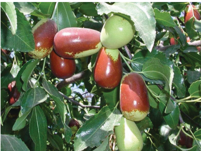
Figure 19. 'Lang'.