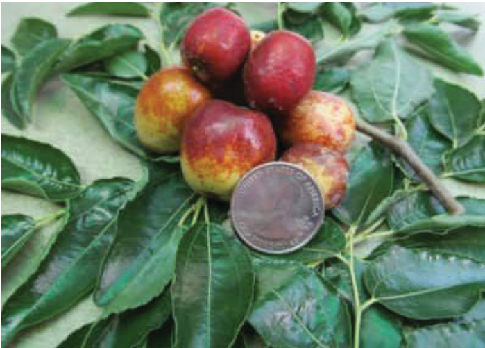
Figure 18. 'Honey Jar'.