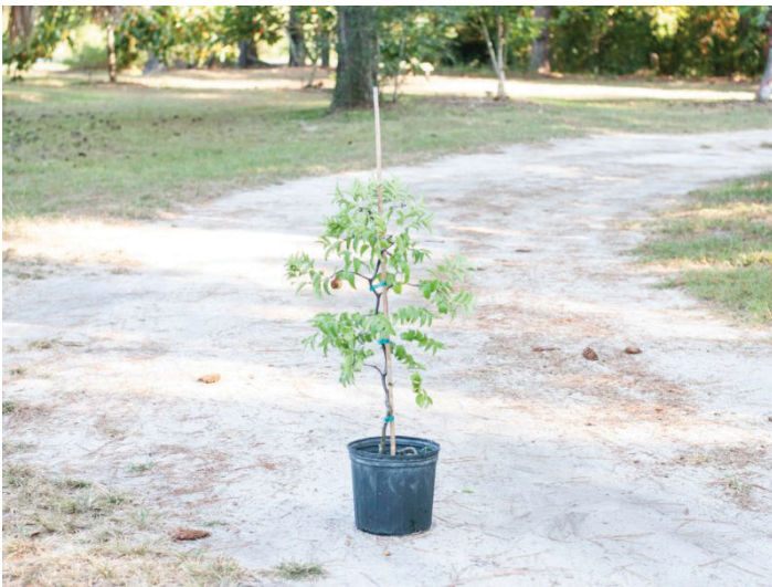
Figure 10. One-year-old jujube plant propagated by sucker.