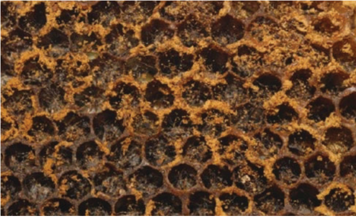
Figure 6. Wax moth damage to wax comb. The damage is the result of wax moth feeding, larval webbing, and frass.