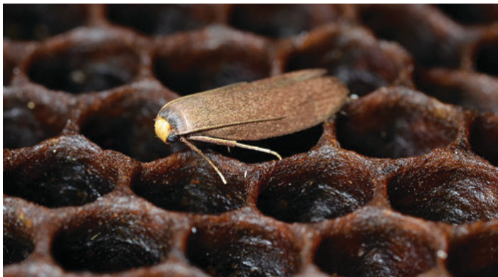
Figure 1. An adult lesser wax moth, Achroia grisella Fabricius, on a piece of brood comb.

Achroia grisella Fabricius, the lesser wax moth (Figure 1), is considered a pest of unoccupied honey bee, Apis spp., hives and stored hive materials. However, wax moths can be considered beneficial insects in wild/feral colonies because they destroy combs that remain after a colony of bees dies or abandons the nest site. These abandoned combs potentially harbor pathogens and/or pesticide residues that have been left behind by the previous colony. Wax moths consume the abandoned combs, thereby minimizing the risk for exposure to future inhabitants of the cavity. Lesser wax moths have a similar life history to that of greater wax moths, Galleria mellonella L.