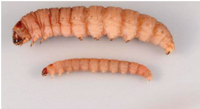
Figure 3. Late instar greater wax moth, Galleria mellonella L., larva (top) and lesser wax moth, Achroia grisella Fabricius, larva (bottom). The two species are similar in appearance with the major difference being size.