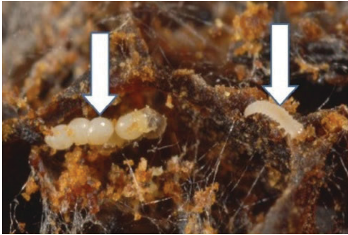
Figure 2. Eggs (left) and a first instar (right) of the greater wax moth, Galleria mellonella L., shown here due to the lack of images of lesser wax moth, Achroia grisella Fabricius, eggs and first instar larvae. Lesser wax moth eggs are very similar to the eggs of the greater wax moth.

Larvae tunnel through beeswax comb spinning tunnels of silk, which they cover in frass (feces). The larval stage is the only life stage that eats. Larvae typically consume comb containing bee brood (honey bee larvae and pupae), pollen, and honey. Larvae prefer brood and pollen comb to virgin and/or honey comb. However, lesser wax moths are often found feeding on the hive floor because greater wax moths outcompete them for the desirable brood comb in areas where both species co-occur.