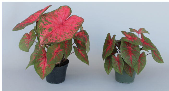
Figure 3. Plants of 'Lava Glow' caladium forced from one intact (left) or de-eyed (right) No. 1 (1.5 to 2.5 inches in diameter) tuber in a small container (5-inch diameter). Tubers were planted on 1 May 2020, and plants were grown in a greenhouse with approximately 30% light exclusion. The photo was taken on 22 June 2020.

had about 20 leaves, and the leaves were 6.3 inches long and 4.1 inches wide (Figure 3). 'Lava Glow' and the two checks, 'Brandywine' and 'Freida Hemple', were not significantly different in plant height, number of leaves, leaf length, and leaf width, except that they were significantly different in plant width (Table 2). Plants of 'Lava Glow' were 2 to 3 inches narrower than plants of 'Brandywine' or 'Freida Hemple'. Plants of 'Lava Glow' from intact tubers received a quality rating of 3.9 (on a scale of 1 to 5), significantly higher than the plant quality rating of 'Brandywine' or 'Freida Hemple' (Table 2). Plants of 'Lava Glow' from de-eyed tubers received a quality rating of 3.4, which is not significantly different from that of the two checks. Generally de-eyed tubers produce higher-quality pot plants. However, this was not observed with de-eyed 'Lava Glow' tubers, because de-eyeing delayed color development on 'Lava Glow' leaves (Figure 3).