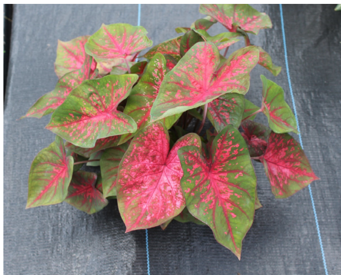
Figure 4. Typical leaves of ‘Lava Glow’ caladium (approximately 8 weeks old) grown under shade in Wimauma, FL. The plant was grown from one No. 1 tuber that was planted 22 May 2020, and this photo was taken on 16 July 2020.

width, sunburn tolerance, or leaf health, whether they were evaluated 2 or 3 months after planting (Table 5).