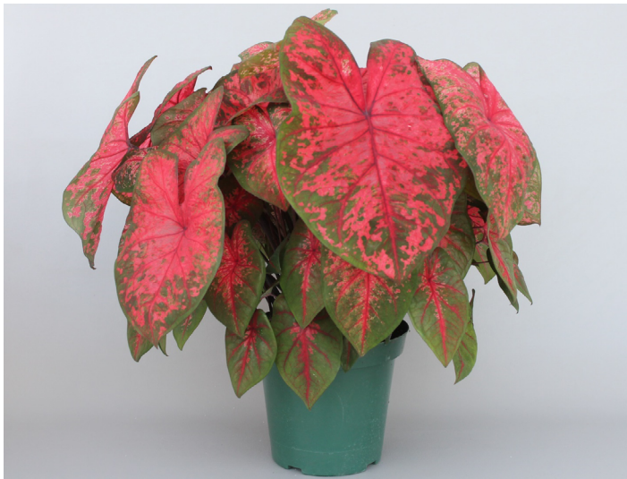
Figure 2. A typical plant of 'Lava Glow' (35-day-old) caladium forced from four No. 1 (1.5 to 2.5 inches diameter) tubers in an 8-inch container. Tubers were planted on 14 May 2020, and the plant was grown in a greenhouse with approximately 30% light exclusion. The photo was taken on 19 June 2020.

'Lava Glow' plants forced from four intact No.1 tubers in 8-inch containers for approximately 8 weeks have an average height of 16.9 inches and an average width of 26.4 inches (Figure 2). Mature leaves are heart-shaped with two large lobes and palmate-pinnate veins on the main blade. Primary and secondary veins are red. The upper surface has a green margin, up to 0.4 inches wide, bordering the entire leaf except for the basal leaf sinus, where it is red. Interveneal areas in the center of the leaf blade are red. Numerous irregular spots and blotches of different sizes in red are located between the large red center and the margin. The undersurface has a primarily red-purple center with red-purple primary veins. Numerous small blotches and spots of red-purple are located between the center and the margin. Petioles are dark brown variably streaked with light brown, light purple and deep red-purple. Tuber surfaces are grayed-orange with the cortical area yellow-orange.