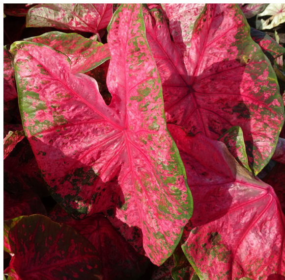
Figure 5. Typical leaves of ‘Lava Glow’ caladium in grower trials in open fields and full sun. Photo taken in Lake Placid, FL on 13 September 2019.

Three Florida caladium growers evaluated ‘Lava Glow’ in their fields using their production practices and compared ‘Lava Glow’ to their main caladium cultivars. Grower trial data indicated that ‘Lava Glow’ scored 4 or 5, on a scale of 1 to 5, in plant growth, leaf color and sunburn tolerance in each month from July to October 2019 (Figure 5). ‘Lava Glow’ performed well in grower trials compared to commercial cultivars.