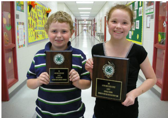
Figure 2. 4-H School Enrichment increases the capacity of Extension to reach more youth in the community.

Evaluation should also include your presentation to teachers and school administrators. Use a standard evaluation tool or devise a simple evaluation form specific to your presentation. If possible, try to get names and contact information of participants for future mailing lists.