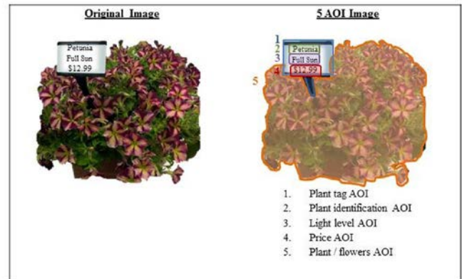
Figure 1. Example of an original product image and the same product image with five areas of interest (AOI) outlined to obtain detailed visual measurements from eye-tracking recordings

After the participant's eye movements have been recorded, geometric areas of interest (AOI) are defined using the eye-tracking software (Figure 1). Each AOI is a polygon encompassing an attribute of interest within the image. For instance, in Figure 1, there are five AOIs: the plant tag, the plant type, the light level, the price, and the plant itself. The attributes of interest are research-dependent and include any visual stimuli being investigated.