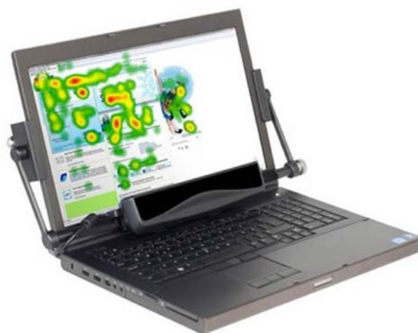
Credit: Example of eye tracking device by permission from Tobii.

Advances in eye-tracking technology have resulted in increased availability of less expensive, easier-to-use equipment that can be used by marketers to better