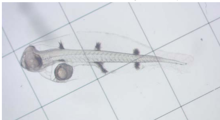
Figure 3. French grunt larva shortly after hatching.

Larvae have been reared in 13 L, 60 L, and 350 L tanks at the Tropical Aquaculture Laboratory (TAL). The influence of background color on feeding success and larval survival has not been evaluated with French grunts. Early larvae