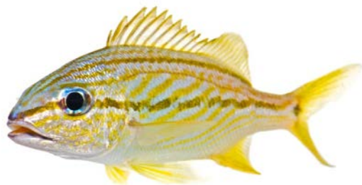
Figure 1. French grunts, Haemulon flavolineatum .