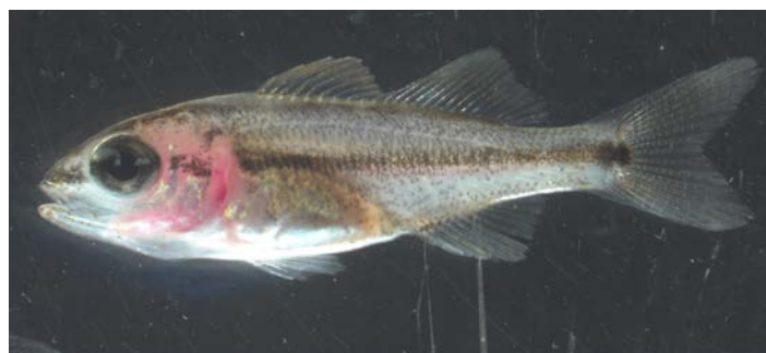
Figure 4. Post-metamorphosis juvenile French grunt at 35 days post hatch.

Aeration is increased slightly at 4 days post hatch (dph), and a slow flow of water from the central filtration system is administered to help reduce nitrogenous waste build-up in the larval rearing tanks. At 10 dph, Artemia nauplii are added at a density of 0.5–1.0/mL. Aeration and water exchange are increased sequentially as the larvae grow in order to maintain high oxygen levels and reduce waste build-up in the tank. Rotifers are removed from the diet by 21 dph. At this time, dry feeds are introduced each morning before Artemia nauplii to facilitate weaning. An equal mixture of Otohime B1 (250–360 µm) and B2 (360–650 µm) dry feed (65% protein, 10% fat) is used during weaning. All fish were weaned to a dry diet by 30 dph. Metamorphosis occurs between 25–30 dph when individuals undergo morphological and behavioral changes that, upon completion, result in juvenile fish (Figure 4).