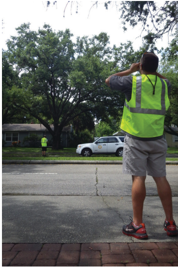
Figure 2. Urban trees can often impact multiple targets. Credits: Gitta Hasing

Time Required to Complete: Approximately 20 minutes for a basic, 360-degree visual assessment, using a diameter tape and a digital hypsometer (Figure 2). Time required should decrease as the user gains greater familiarity with the process and form.