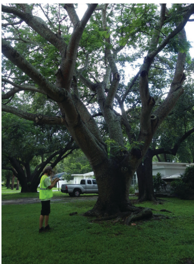
Figure 1. The three risk assessment processes reviewed all included data entry forms to facilitate the systematic collection of standardized information.