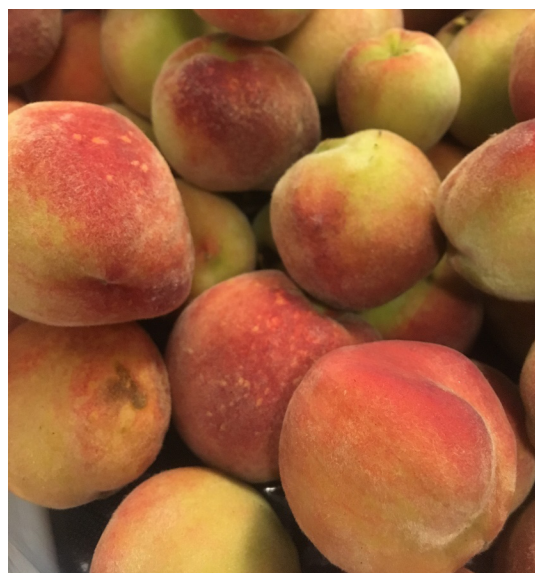
Figure 3. Peaches can grow in USDA hardiness zones 4 through 9 and require proper pruning to yield a good harvest.

Pruning strategies are based on crop needs. Because pruning is specialized to specific plants, it is important to research the plant that you are pruning. For example, removing and pruning tomato shoots promotes more flower growth, resulting in greater fruit production. Removing the flowers of peach and citrus trees during the first two years allows young trees to focus more energy into the roots and leaves of the plant. They will be healthier and more robust, yielding greater fruit production in later years (Figure 3). The same principles apply on a smaller scale to herbs. When handling herbs such as basil, pinching back the stem every one to two weeks prevents leggy growth (Figure 4).