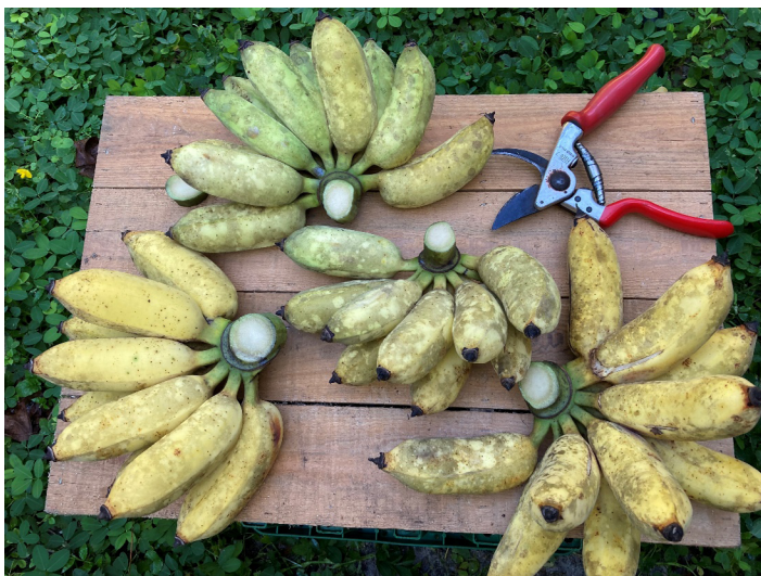
Figure 2. A pair of hand pruners are an essential tool because they can be used for pruning and harvesting.