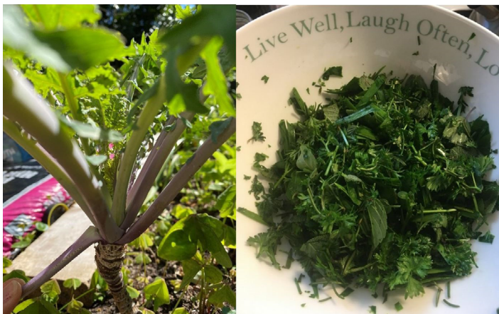
Figure 4. Harvest kale by hand, selecting the most basal leaves for consumption (left). Herbs like basil, parsley, and kale can be harvested year-round in a Florida-Friendly edible landscape (right).

Pruning just before spring growth begins leaves fresh wounds open for a short time before new growth can seal the wound. In Florida, prune in the fall and winter, when the plant is dormant. Improper pruning can inhibit yield and create environments that are ripe for plant pathogens or insect infestations. For more information on pruning deciduous fruit trees and good practices in pruning, visit https://gardeningsolutions.ifas.ufl.edu/care/pruning/pruning-deciduous-fruit-trees.html .