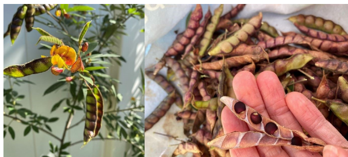
Figure 6. Pigeon pea growing (left) in an upright shrub. Pigeon pea is harvested (right) by picking mature fruits from the plants.

Most fruits and vegetables will change color as they ripen and begin to emit their signature fruity scent. There are many harvesting methods available depending on the plant. These include hand harvesting, harvesting with hand tools, and harvesting with machinery (Figure 6). Any tools used in harvesting should be cleaned and sanitized before using them on other plants to prevent disease transmission.