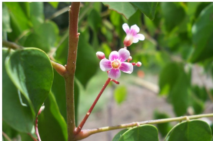
Figure 5. Starfruit flowers are followed by an abundant harvest.

Harvesting is an important part of maintaining an edible landscape. Consuming the edibles produced on site is not only a way to enjoy fresh food, but the ritual of harvesting also helps identify plant needs. Many annual crops will have the number of “days to harvest” listed on the seed packet, but if you are growing perennial edible shrubs and trees, that information may not be available. Watch for buds, then flowers (Figure 5). Once the flower is pollinated, the ovary will start to swell and become the fruit. It is especially important to observe the fruit as it nears maturity because animals or insects might also be interested in the fruit as it ripens.