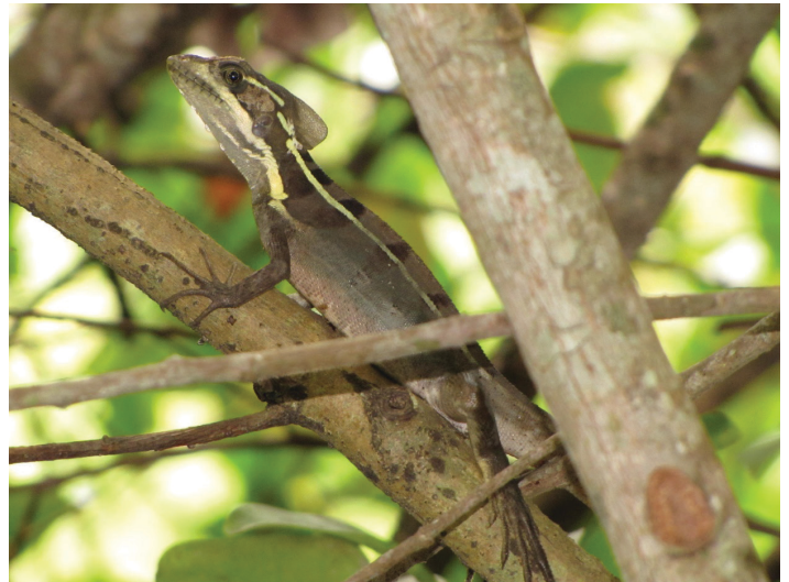
Figure 4. Adult female brown basilisk. Females and juveniles of this species have dark bands on their back and sides.

The body of adult brown basilisks ranges from approximately 4.5 to 6.5 inches long and males are larger than females. When including their long tail, adults range in size from 11 to 27 inches (Fitch 1973a and b; Savage 2000; Krysko et al. 2019).