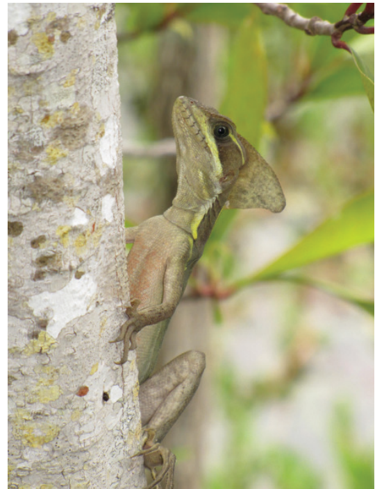
Figure 1. Adult brown basilisk. Note the head crest, which is found on both male and female brown basilisks but is more developed in males.

While not all introduced nonnative species can survive and produce self-sustaining populations without human assistance, some do. They are referred to as “established” in new areas (Iannone et al. 2021). Florida has experienced more introductions of nonnative reptile species than any other region on Earth, and there are approximately three times as many species of established, nonnative lizards in the state as there are native species (Krysko et al. 2016). These established species range in size from the small (to 6 in.) Cuban brown anole ( Anolis sagrei ), to the large (to 7 ft.) Nile monitor ( Varanus niloticus ). Among Florida’s approximately 50 species of nonnative lizards is the brown basilisk ( Basiliscus vittatus ), an established species within the family Corytophanidae (Krysko et al. 2006). Members of the family Corytophanidae are referred to as helmeted or casque-headed lizards due to their distinct head crests (Figure 1).