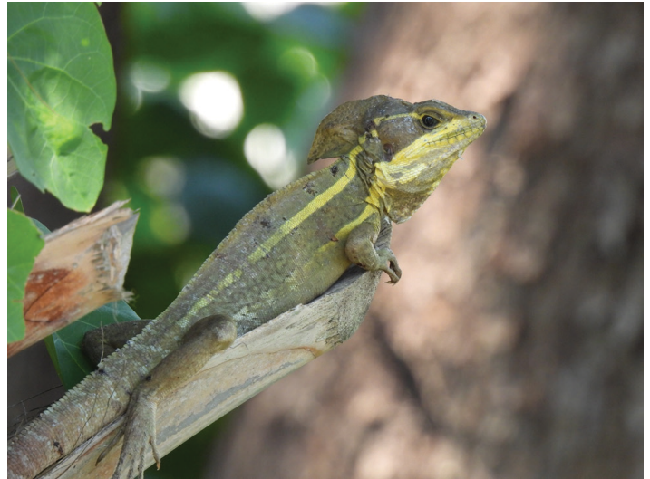
Figure 3. Adult male brown basilisk showing the well-developed head crest and distinct yellow, lateral stripes.

other Florida lizards is their prominent head crest. The crest is largest in adult males, and they sometimes have a distinct, fin-like crest on their back and tail. Small basilisks of both sexes lack the head crest. The rear legs of juveniles are especially long. Juvenile and female brown basilisks have dark bars on their back and sides (Figure 4).