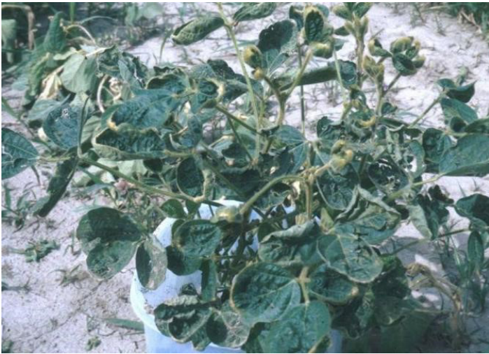
Figure 1. Organo-auxin herbicide drift symptoms on sensitive plants.