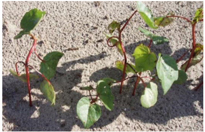
Figure 4. Organo-auxin herbicide drift symptoms on sensitive plants.