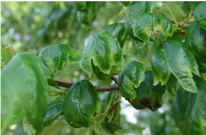
Figure 2. Organo-auxin herbicide drift symptoms on sensitive plants.