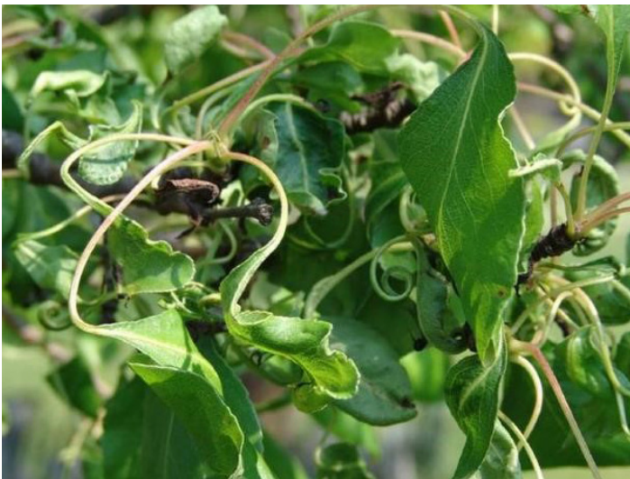
Figure 3. Organo-auxin herbicide drift symptoms on sensitive plants.