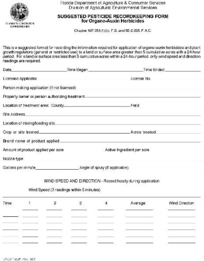
Figure 5. Suggested form for recording organo-auxin application data.

The Florida Organo-Auxin Herbicide rule 5E-2.033 appears in the Florida Pesticide Law and Rules. All inquiries should be addressed to: