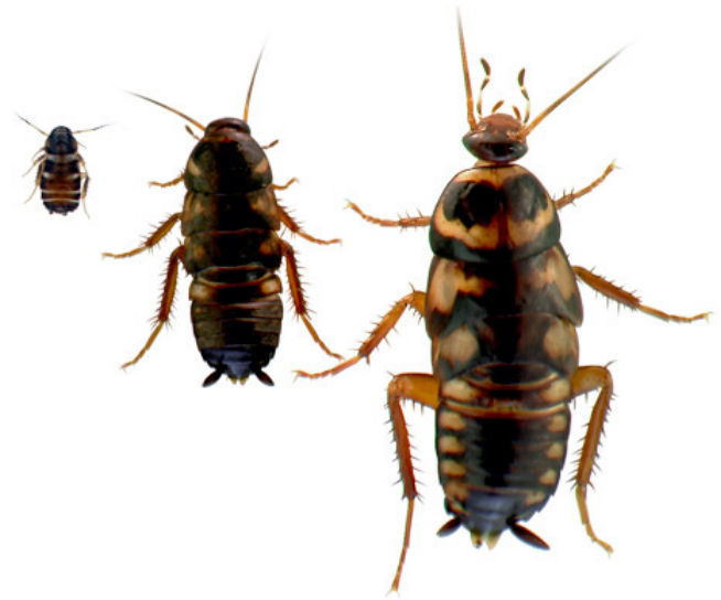
Figure 4. First, third and fifth instar nymphs of the Australian cockroach, Periplaneta australasiae Fabricius. Credits: Urban Entomology Laboratory, University of Florida

Adults: The adults are about 32-35mm long and range in color from reddish-brown to dark-brown and have completely developed and functional wings, capable of