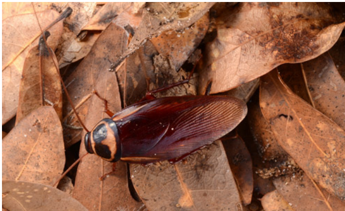
Figure 1. Dorsal view of an adult Australian cockroach, Periplaneta australasiae Fabricius.

The Australian cockroach is one of several species of peridomestic cockroaches (cockroaches that live mostly outdoors, but occasionally may be found indoors) and the most common cockroach species found outdoors in southern Florida. This species resembles the American cockroach but can be distinguished by the presence of light yellow bands on upper margins of the forewings (Figure 1).