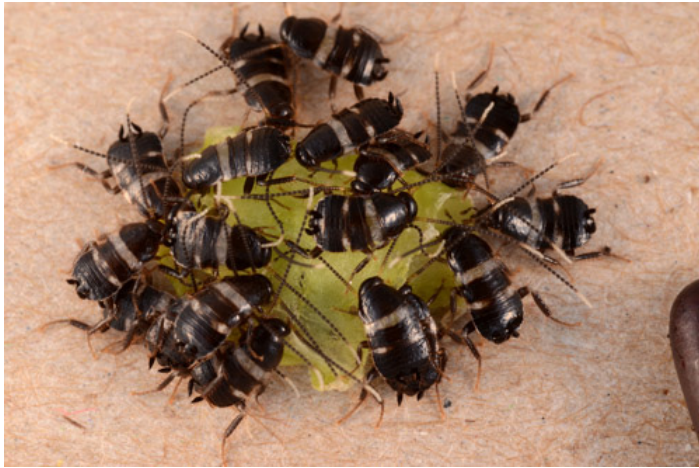
Figure 2. Australian cockroach, Periplaneta australasiae Fabricius nymphs feeding in a group.

other environments with dark and warm conditions (Figure 2).