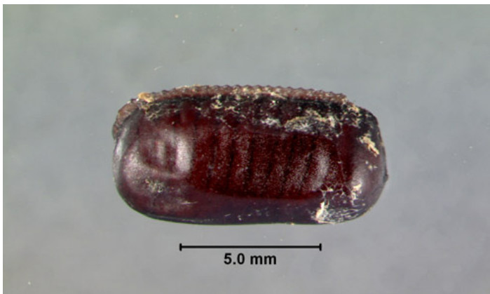
Figure 3. A fully developed and detached ootheca of the Australian cockroach, Periplaneta australasiae Fabricius.

Eggs: The eggs are deposited into an ootheca (a structure where eggs are held together) with a length of up to 11 mm (Kramer et al. 2009). The ootheca is attached to and carried by the adult female on the tip of her abdomen and deposited long before the eggs hatch (Cornwell 1968) (Figure 3).