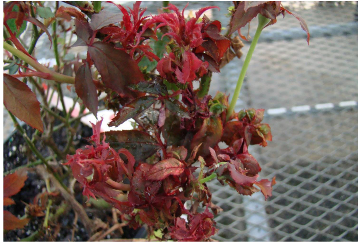
Figure 1. Clustering of small branches (witches'-broom)