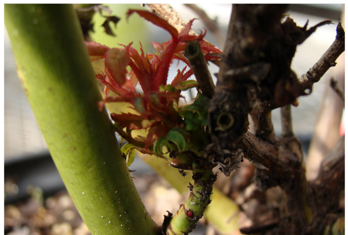
Figure 10. Distorted sprouting and dieback of shoots