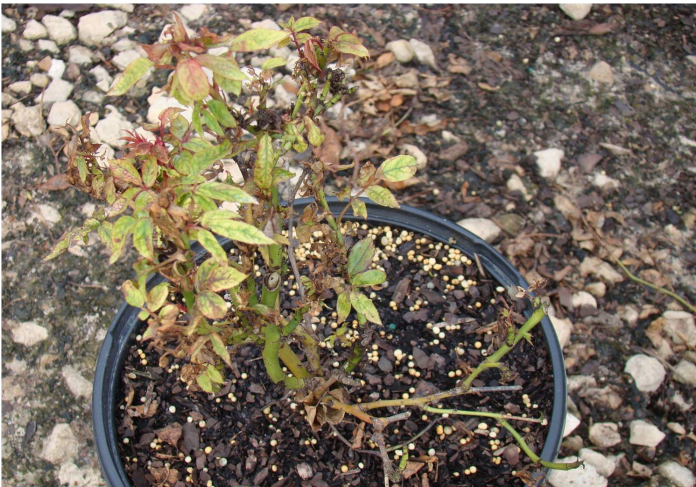
Figure 12. Severe yellowing and stunting of plants