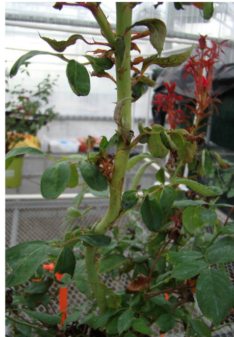
Figure 9. Swollen shoots