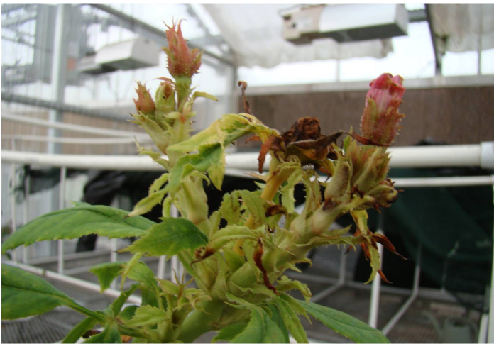
Figure 6. Deformed flower buds with multiple flowers in a single bud