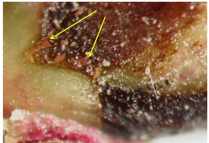
Figure 13. Eriophyid mite Phyllocoptes fructiphilus associated with the transmission of Rose rosette virus

RRD is vectored by the eriophyid mite Phyllocoptes fructiphilus , which is native to North America (Figure 13). These mites are microscopic, measuring 140 to 170 microns long and approximately 50 microns wide. They have a spindle-shaped structure and are typically yellow to brown in color. One of the identifying features of an eriophyid mite is its four legs; other mite species typically have eight legs. Eriophyid mites are typically found in the angles between leaf petioles and axillary buds. In early spring, these mites migrate onto developing shoots, where females lay eggs. Females may live up to 30 days, laying one egg per day. Young mites develop within the leaf folds of new shoots or under leaf petioles. The mites do not possess wings, so they move from plant to plant by attaching to insects and being dispersed by wind (Armine and Zhao 1998; Hong, Hansen, and Day 2012).