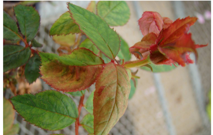
Figure 3. Leaf reddening

the active ingredient in Round-up® (Cloyd 2011; Hong, Hansen, and Day 2012; Olson and Rebek 2014). Glyphosate can cause witches'-broom as well as stunted, narrow leaves on roses. The commonly used broadleaf herbicide 2, 4-D can also cause leaf distortion on roses. However, such herbicide injuries should disappear in the following year, unless plants are injured again by spraying. Symptoms of a nutrient deficiency will typically affect the whole plant, whereas appearance of such symptoms on selected parts of the plant are probably due to RRD. Thus, checking for a combination of RRD symptoms is an important part of accurately diagnosing the disease.