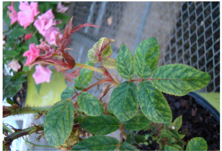
Figure 8. Leaf mosaic and reddening