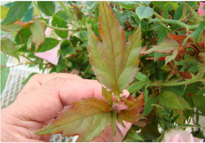
Figure 5. Distorted leaf shape