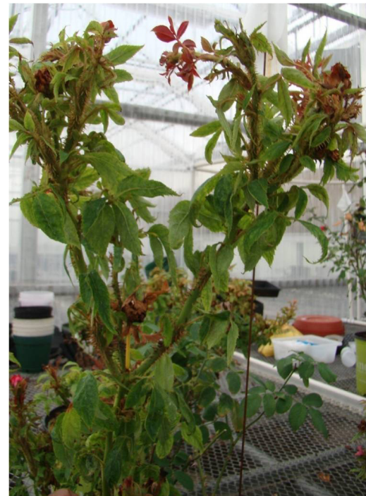
Figure 4. Rapid elongation of new shoots