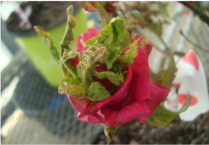
Figure 11. Unusual development of leaves within the flower