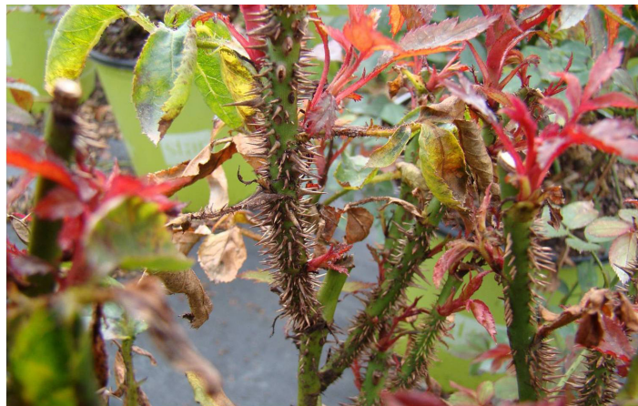
Figure 2. Excessive thorn proliferation

Infected rose plants often die within one to two years. A diseased plant may exhibit only some of the above mentioned symptoms, especially in the early stages of the disease. Unusual red pigmentation is not a consistent symptom. The new leaves of many rose cultivars normally have reddish pigments, and it may be difficult to determine whether the reddish color is abnormal or not. However, on RRD-infected plants, the reddish color does not go away with age or time, whereas on healthy plants, the reddish color usually disappears as the leaf matures. Therefore, it is important to continue to monitor symptoms on suspect roses. Symptoms of RRD may also resemble herbicide drift damages, which are caused by chemicals such as glyphosate,