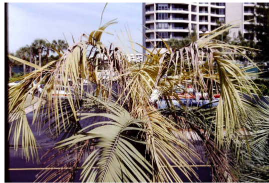
Figure 4. Manganese deficiency in pindo palm. Note the necrosis of leaflets on the basal part of the youngest leaves.

To prevent or correct nutrient deficiencies in pindo palms, 3 (4 in south Florida) applications per year of a controlled release 8N-2P 2 O 5 -12K 2 O-4-Mg plus micronutrients fertilizer are recommended. For more information about fertilizing landscape palms in Florida see Fertilization of