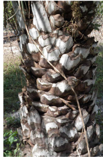
Figure 2. Trunk of pindo palm showing persistent leaf bases.

The palm is slow-growing, eventually reaching 15–20 feet, making it suitable for planting under power lines (Figure 1). Its gray-green recurved leaves are about 4–6 feet long and have leaflets attached to the petioles in a deep V shape. The petioles have spines along their margins. The leaf bases are strongly persistent and give the trunk a distinctive knobby appearance (Figure 2). The 3–4-foot-long flower stalks eventually produce edible 1-inch-diameter yellow to orange fruits. Pindo palm seeds are notoriously slow and difficult to germinate, but research has shown that simply cracking