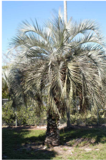
Figure 1. A 35-year-old pindo palm ( Butia odorata ).

The pindo or jelly palm was formerly known by the scientific name Butia capitata . However, recent research has shown that the correct name for this palm should be B. odorata . This small, single-stemmed, feather-leaved palm is widely grown in warmer parts of the US due to its unusual cold tolerance. It is considered hardy down to about 10°F or USDA zone 8A (see http://planthardiness.ars.usda.gov/PHZMWeb/ ). While they survive in south Florida, pindo palms grow much better in cooler, less humid climates. They are considered to be intolerant of salt spray.