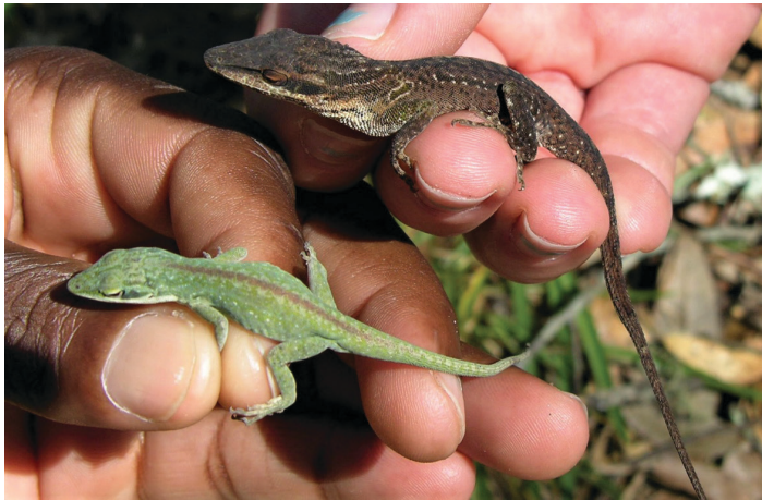
Figure 6. Florida's only native anole, the green anole ( Anolis carolinensis ), can change color from green to brown and vice versa. Despite this ability, they are not true chameleons, which are an entirely different family of lizards. Although green anoles may be brown, brown anoles ( Anolis sagrei ) are never green.

brown anoles, and males in most of the state have a pink dewlap (Figure 7). Males in southwestern Florida usually have a gray or dull-green dewlap. Female green anoles have a thin, light stripe down the center of their back (Figure 8). Another similar-looking species to the brown anole is the crested anole ( Anolis cristatellus ). The males are brown and usually have a thin, jagged crest along their backs and/or tail (Figure 9). Male crested anoles display a dewlap that is orange with a yellow center (Figure 10). Crested anoles occur mainly in Miami-Dade County. Another introduced anole species that may be confused with the brown anole is the bark anole ( Anolis distichus ). This species lacks the bold markings of the brown anole, instead having mottled light and dark patterns across the body. Males bark anoles have pale yellow to pale green dewlaps that may have a light orange spot (8) (Figure 11). This species is also much smaller than the brown anole and only occurs near the coastline in southern Florida.