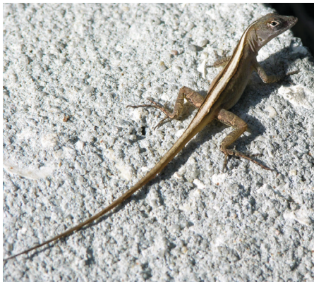
Figure 3. Female brown anoles ( Anolis sagrei ) have a light-colored line down the center of their back, though it's not always as well demarcated as this individual.