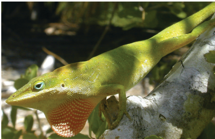
Figure 7. Male green anoles ( Anolis carolinensis) in most of Florida have a pink dewlap (i.e., throat fan).