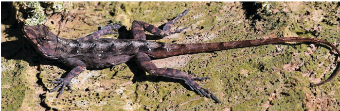
Figure 2. Brown anoles ( Anolis sagrei ), especially adult females, may be boldly patterned.