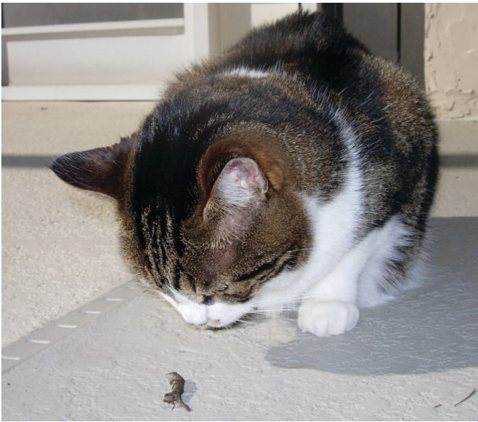
Figure 13. Domestic cats are efficient predators, and brown anoles ( Anolis sagrei ) are enticing prey.

anoles is another way to help keep their numbers in check around your yard. To humanely euthanize a brown anole, place it in a sealable container or plastic bag, put that in a refrigerator for 2–3 hours, and then transfer it to the freezer for 24 hours. Chilling physically anesthetizes the lizard, and freezing ensures a humane death. Dispose of euthanized lizards in the trash (if sealed in a bag) or just remove the lizard from the container and toss it your yard to decay naturally. And finally, if you observe a brown anole in Florida's Panhandle outside of the area shown on the map in Figure 12, take a digital image of it and report your observation at EDDMapS.org. iNaturalist is also a good place to report brown anole observations.