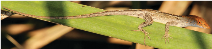
Figure 1. Brown anoles ( Anolis sagrei ), such as this individual from MacArthur Beach State Park in Palm Beach County, sometimes have reddish-colored heads.

The brown anole (pronounced uh-NOLE), also known as the Cuban brown anole, is a small lizard that grows to a total length (snout to tail tip) of 5 to 9 inches (8). The sexes differ in size, with mature females being slightly smaller than mature males. Hatchlings are about 1.5 inches long and resemble adult females in pattern (9). Brown anoles, while usually brown, can vary their shade by lightening or darkening their skin, and colors range from brown to gray to black, and some are even red or have a reddish head (Figure 1). They often have intricate patterns on their back and sides, such as stripes, triangles, spots, and dashes of lighter and darker colors (Figure 2). Females almost always have a light-colored stripe running down the middle of their back (Figure 3) and are more boldly patterned than males. Males can erect a smooth-edged crest on their neck, back, and tail (Figure 4). Males also have a bright, reddish-orange throat fan (i.e., dewlap) bordered by yellow, which they extend to signal their presence (Figure 5).