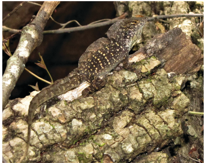
Figure 4. Male brown anoles ( Anolis sagrei ) may erect a dorsal crest as a territorial display.