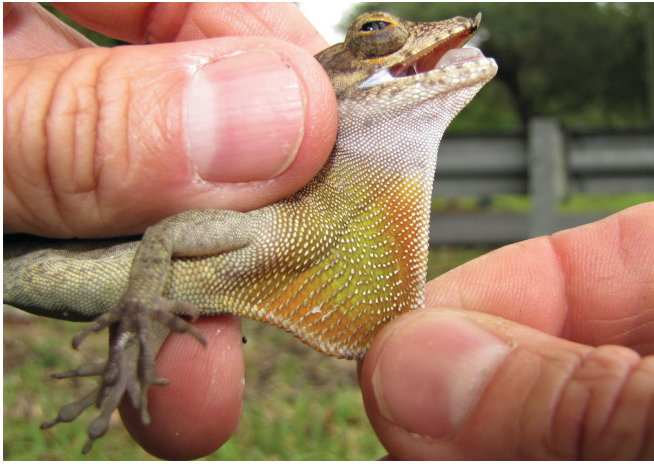
Figure 10. The dewlap of male crested anoles ( Anolis cristatellus ) has a yellow-colored center. This species occurs primarily in south Florida in Miami-Dade County