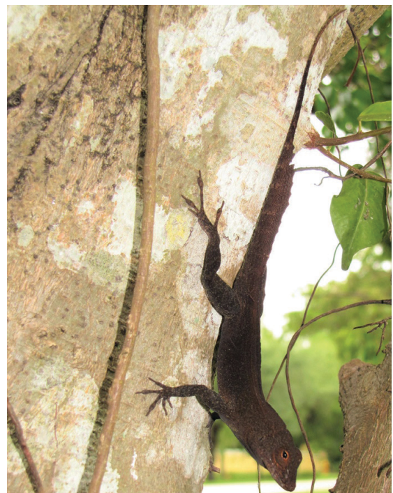
Figure 9. Crested anoles ( Anolis cristatellus), another introduced species in Florida, look like brown anoles. Crested anoles get their name from the jagged-edged crest on the adult males.