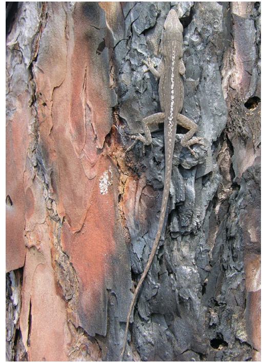
Figure 8. Like female brown anoles ( Anolis sagrei ), female green anoles ( Anolis carolinensis ) also have a light-colored line down the center of their back.