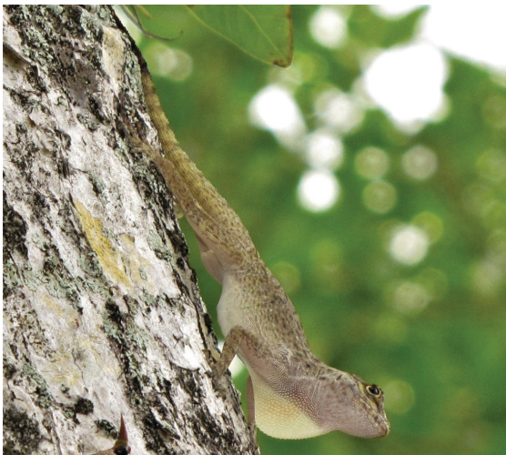
Figure 11. Male bark anoles ( Anolis distichus ), also introduced in Florida, have a whitish or light-yellow dewlap, in contrast to the bold orange dewlap of male brown anoles.