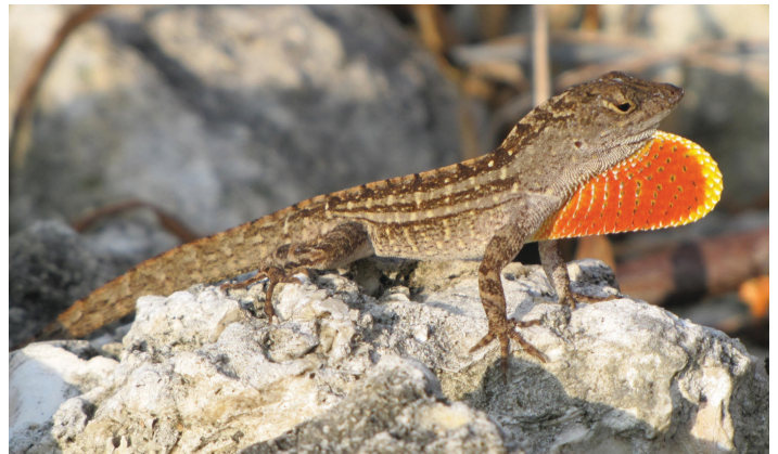
Figure 5. Male brown anoles ( Anolis sagrei ) advertise their presence by extending and retracting their dewlap (i.e., throat fan). The dewlap in this species is orange with a yellow border. Adult females also have a dewlap, but it is quite small.