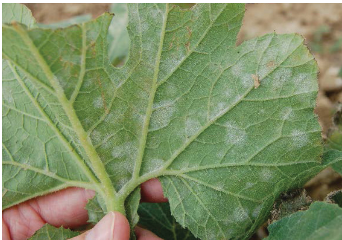
Figure 4. Powdery mildew on the lower surface of squash leaves.

powdery masses are spread by wind to nearby plants causing further infections. Severely infected leaves eventually turn yellow, then brown, and may eventually die, leaving fruits exposed to sunburn. The fungus does not infect the fruit directly. However, if the disease is severe, premature ripening may occur, and yield could be significantly reduced.