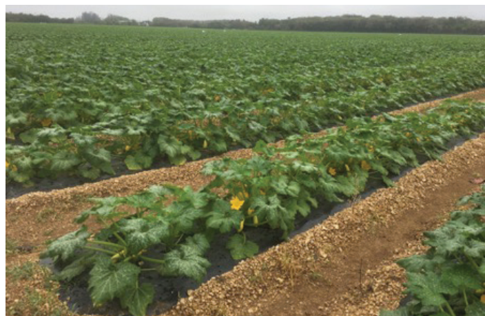
Figure 2. Yellow squash grown on plastic mulch in Miami-Dade County.

Irrigation is applied to squash using sprinkler systems such as lateral move/center pivot or big guns. Some growers are using plastic mulch to save irrigation water and suppress weeds (Figure 2). Principles and practices of irrigation management are discussed in Chapter 3 of the Vegetable Production Handbook for Florida https://edis.ifas.ufl.edu/entity/topic/vph .