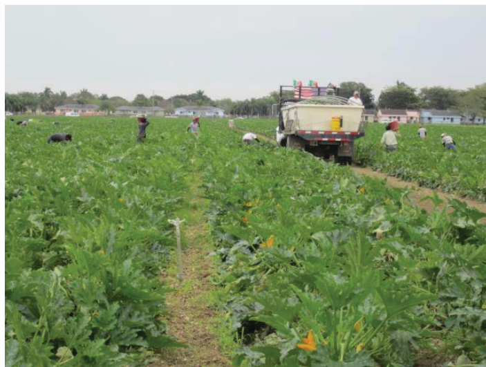
Figure 12. Overview of a zucchini production in calcareous soils in Miami-Dade County.

The harvest season extends from October into April. Squash is hand-picked.