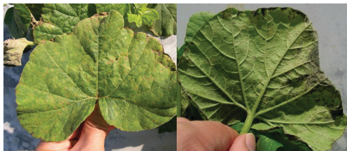
Figure 3. Symptoms of downy mildew on upper side (left) and underside (right) of butternut squash leaves. Note the gray-brown to purplish-black 'down' on the underside of the infected leaves.

when the leaf is wet, such as in the morning. The severely infected leaves will turn brown and die prematurely.