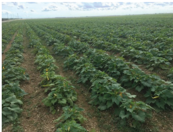
Figure 1. Overview of a yellow squash field in calcareous gravelly soils of Miami-Dade County.

Summer squash is an important vegetable crop in Miami-Dade County (Figure 1). Summer squash is grown annually on about 6,000 acres and sold nationwide during the winter in the fresh market. Production costs range from $14.51 to $11.47 per bushel or $4,353 to $5,162/acre for an acceptable yield of 300 to 450 ($9.67 to 17.20/bushel), 42-pound bushels/acre, respectively.