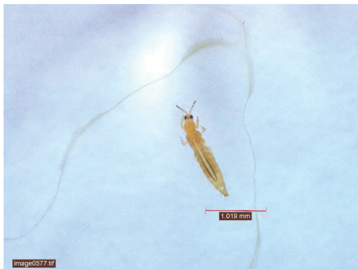
Figure 8. Melon thrips adult.

Melon thrips arrived in Miami-Dade County in 1990 and caused defoliation of squash, cucumber, beans, pepper, eggplants, and okra. Later, it spread to Broward, Palm Beach, and Collier Counties. Melon thrips occur in all seasons when a proper host crop is available. However, peak abundance of melon thrips is usually observed from December to May. Larvae and adults on the undersurface of the leaves feed on the epidermal layer. Adults of melon thrips and other species can also be found in blooms. Melon thrips developed resistance to various groups of chemical insecticides. Management of melon thrips is based on cultural practices meant to increase predatory bugs (minute pirate bugs, lady beetles, lace wing bugs) and proper use of effective chemicals, such as spinetoram (Radiant), cyazypyr (Exirel), and abamectin (Agrimex).