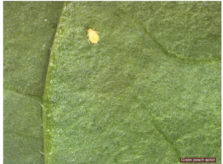
Figure 9. Green peach aphid.

In a severe case, up to 90% of squash plants can be infected with the virus.