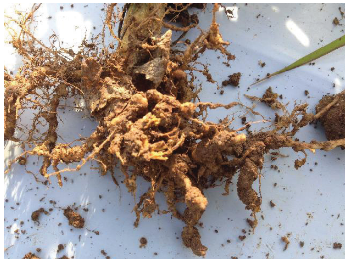
Figure 6. Squash roots showing galls of root-knot nematodes.

Root-knot nematodes invade host plants when they are second stage juveniles and settle within the root to establish a feeding site. Secretions from the nematode cause the surrounding plant cells at the feeding site to enlarge and multiply, producing the galls characteristic of root-knot attack. The female nematode develops within the root, living for as long as several months and laying hundreds to several thousand eggs. Deformation of the roots results in symptoms that include leaf yellowing, plant stunting, wilting, and yield loss.