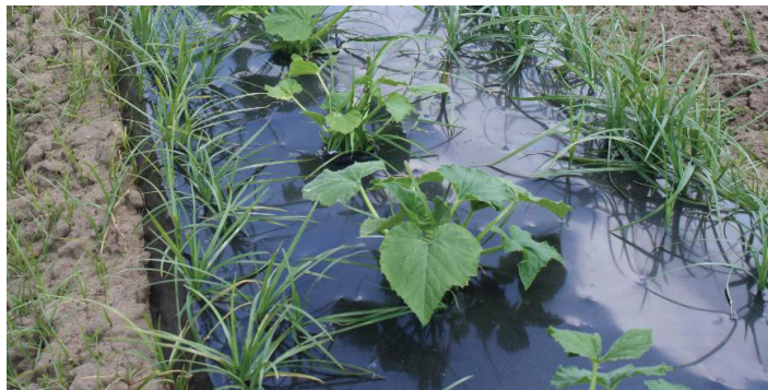
Figure 11. Purple nutsedge emergence through plastic mulch in squash.

grasses can be achieved with clethodim (Arrow®, Clethodim™, Select Max®, others) or clethodim (Poast®). These herbicides control only grass weeds and will not injure the squash plants. If injury does occur, this is the result of using a crop oil concentrate. During periods of extreme heat or high humidity use a nonionic surfactant or no surfactant according to the label recommendations.