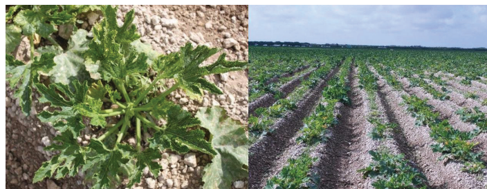
Figure 5. Symptoms of Tobacco streak virus (TSV), on zucchini squash (left), and a severely infected field of squash in Homestead, FL (right).

TSV is efficiently transmitted in fields by thrips such as Frankliniella occidentalis and Thrips tabaci by mechanical means, and could be seed transmitted in some plant species. The existence of diverse genotypes of TSV with distinct serological reactivity and variable symptom expression makes it difficult to accurately diagnose the disease.