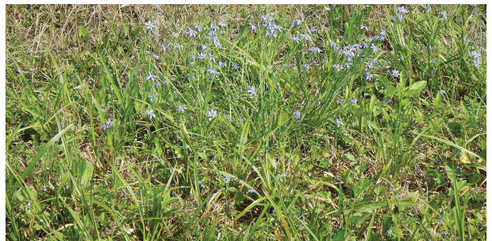
Figure 1. Blue-eyed grass leaf.