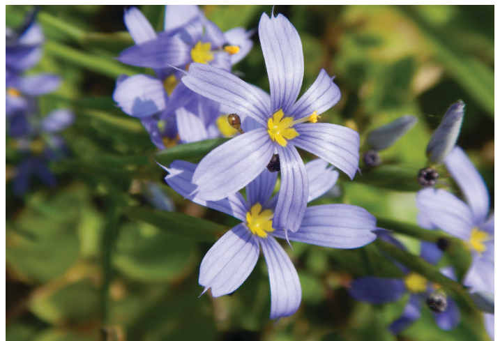
Figure 2. Blue-eyed grass inflorescence.