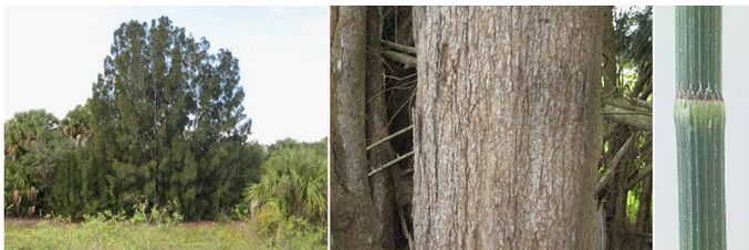
Figure 3. Mature Florida tree, bark and needle of Casuarina glauca .

The trees are moderately tall, perhaps 60 feet at maturity, and rarely occur in the environment as individual trees because they easily spread by root suckers, and their stumps coppice readily (Fig. 3). The trees have a tendency to branch strongly in the upper canopy, leading to a crown profile that is largely upright, smooth, and relatively narrow. The tree is actually quite attractive because of its dark green foliage contrasted with a gray bark (Fig. 3) and a generally dense canopy. Tree appearance is similar to C. cunninghamiana in that the branches and branchlets are droopy, and give the tree a soft look, but the branches and needles are visibly longer in C. glauca . Stands consisting of mature trees and root suckers give the appearance of a small individual plant community.