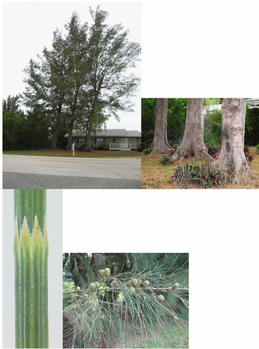
Figure 2. Mature Florida tree, bark, needles and cones of Casuarina equisetifolia .

The trees are moderately tall, perhaps 60 feet at maturity, and rarely occur in the environment as individual trees because they easily spread by root suckers, and their stumps coppice readily (Fig. 3). The trees have a tendency to branch strongly in the upper canopy, leading to a crown profile that is largely upright, smooth, and relatively narrow. The tree is actually quite attractive because of its dark green foliage contrasted with a gray bark (Fig. 3) and a generally dense canopy. Tree appearance is similar to C. cunninghamiana in that the branches and branchlets are droopy, and give the tree a soft look, but the branches and needles are visibly longer in C. glauca . Stands consisting of mature trees and root suckers give the appearance of a small individual plant community.