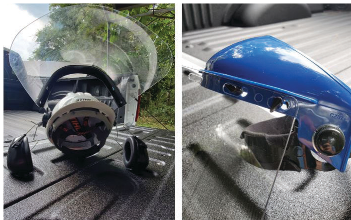
Figure 3. Hardhat face shield with ear protection incorporated and ratchet-style headgear highlighting quick-change levers.

A face shield can either be attached to a hardhat or other headwear, or worn as a simple “ratchet” style headband. Face shields protect the eyes and face and are particularly helpful during high-risk activities like pouring or loading chemicals into a tank. Some face shields have chin guards that curl in toward the face near the bottom of the shield to prevent splashes from below from getting to the face. Pesticide labels might require protective eyewear and a face shield during certain activities. If both are listed in the PPE section of the label, then both must be worn. There are a variety of face shield materials available, so care should be taken to ensure that the face shield matches the type of application. Face shields are interchangeable on most types of headgear, so changing the shield type to match circumstances is easy. For instance, a wire-screen face shield would not be adequate protection for chemical applications.