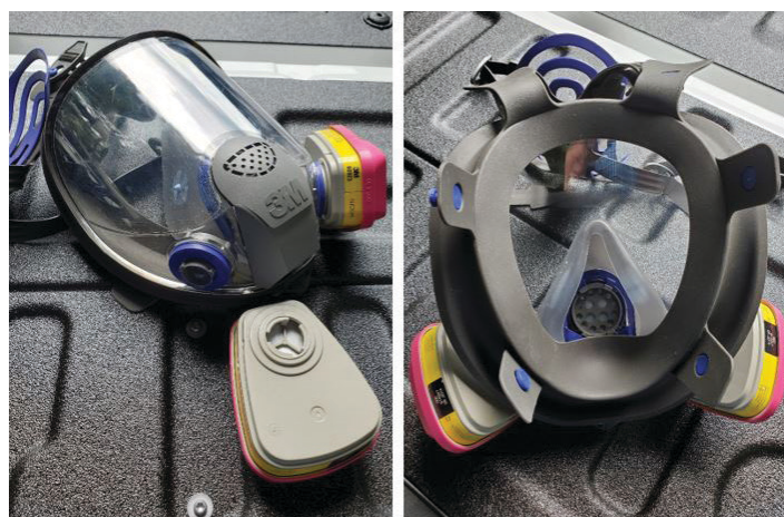
Figure 4. A full-face respirator, which qualifies as goggles, face shield, and respirator in one piece of equipment.

For instances where the pesticide label calls for safety goggles, a face shield, and a respirator, it might be more efficient to combine these into a single piece of PPE, like a full-face respirator. This can improve comfort while wearing all of the necessary equipment (a separate respirator, goggles, and headgear can often rub against each other and create blisters). As with goggles and respirators, ensuring proper fitting of a full-face respirator is paramount. Oftentimes, full-face respirators will come with adhesive shield protectors that can be removed and replaced if damaged. This will reduce the likelihood of permanent scratches and extend the life of the equipment. The use of any respirator requires a yearly medical evaluation and OSHA-approved fit testing. This is required anytime a respirator is worn, even if a label doesn't require it.