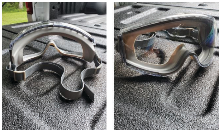
Figure 2. Neoprene safety goggles that seal around the face to better protect eyes from exposure to chemical splashing.

equal to safety glasses and can provide both impact and chemical protection. Like safety glasses, safety goggle lenses can come in a variety of tints. It may be important to trial several brands, styles, and sizes to ensure proper fit and comfort.