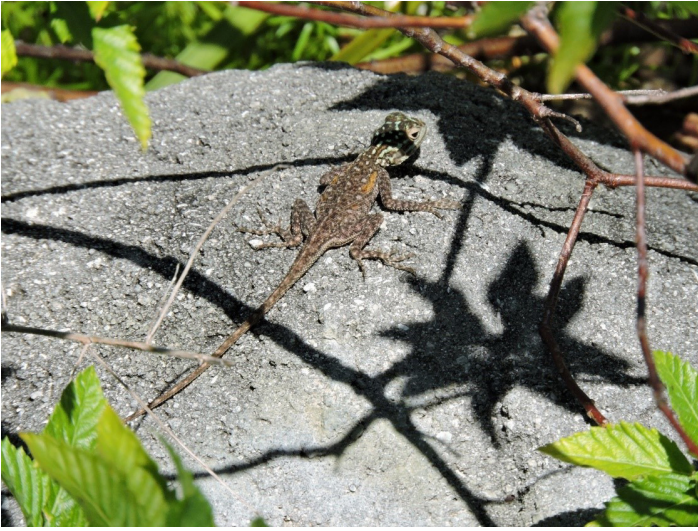
Figure 5. Juvenile Peters's rock agama.