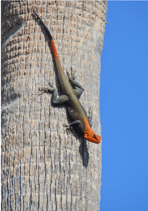
Figure 2. Adult male Peters’s rock agama.

Peters’s rock agama are striking nonnative reptile species in Florida most notable because of the males’ colorful skin and relatively large size as compared to Florida’s native lizards. Adult males can grow to 12 in. including the tail, but females don’t grow quite as large. In addition to their size difference, males and females may look very different. In Florida, adult males in breeding condition are boldly marked with an orange or red head, a black body, and a black-tipped tail immediately preceded by orange coloration (Figures 2 and 3).