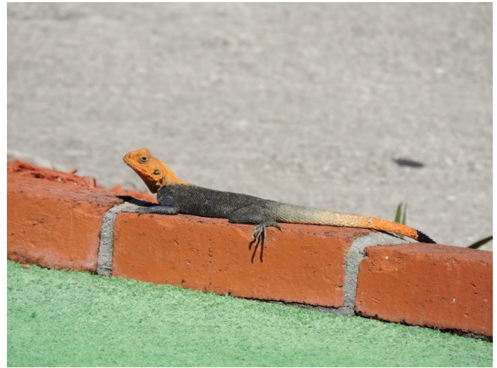
Figure 3. Adult male Peters’s rock agama

Juveniles look like females (Figure 5). Peters’s rock agama scales are “keeled,” meaning ridged and tapering to a pointed tip, giving the lizards a rough-textured look. The scales on their tail, legs, and along the center of their back are strongly keeled. They have wide, blocky heads, thin toes with claws, and long tails that do not easily break.