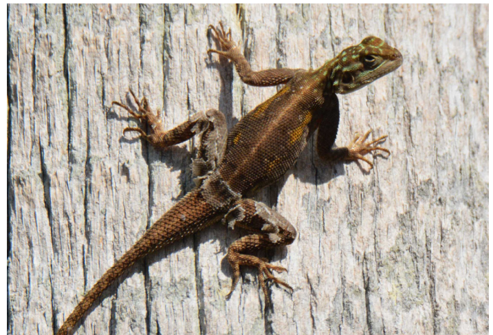
Figure 4. Adult female Peters’s rock agama. Note the shedding skin on this female’s thighs. Like snakes, lizards shed their skins as they grow, but unlike snake skin, lizard skin flakes off in patches.