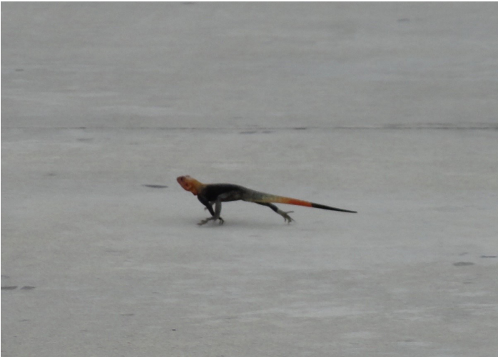
Figure 6. Peters's rock agama are wary of people and often flee if approached too closely.

Peters's rock agama can be dispersed accidentally by vehicles—a large agama was once observed falling from the undercarriage of a car traveling on an interstate highway (Moore 2019). And Gray (2020) suggested their dispersal is also facilitated by railway lines when the lizards inadvertently hitchhike on freight shipped by train. Purposeful releases and “unintentional” modes of dispersal allow them to colonize new areas in Florida.