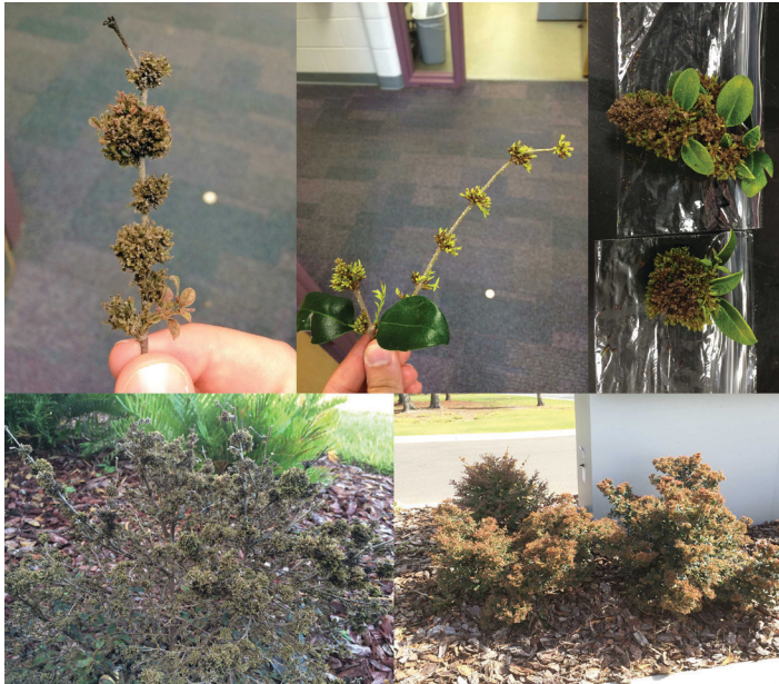
Figure 1. Images of characteristic galling damage observed in Florida landscapes to loropetalum (top left and bottom two) and ligustrum (top center, top right) from undetermined causes.

Most species also rely on microclimatic conditions with high humidity, which typically occur under or around bud scales, the bases of leaf petioles, or depressions in leaf surfaces, or within modified plant growth or structures (galls). Therefore, the galling damage observed on woody ornamentals likely provides ideal conditions to harbor eriophyid mites and may, in some cases, be caused by them.