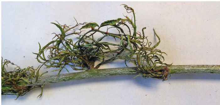
Figure 6. Shoot proliferation at the buds on a rose plant stem.

downward), and bud necrosis (death) are all virus symptoms. For example, a new virus in roses causes rose rosette disease . Although galls are not a symptom, unusual growth, red leaves, and excessive thorniness of stems are symptoms. These plants should be immediately removed and destroyed to prevent spread of the infection to new plants.