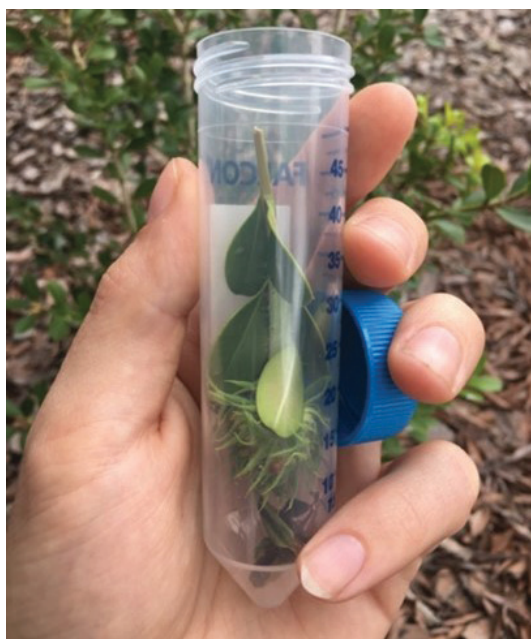
Figure 9. Image of symptomatic tissue collection and preservation for submission to diagnostic labs.

diagnostic method; please contact the individual lab before submitting a sample.