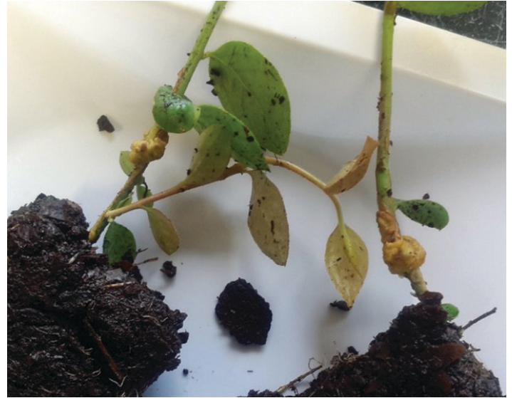
Figure 5. Crown gall on rooted cuttings of southern highbush blueberry stems.

Because the bacterium cannot be cultured, only a test for the phytoplasma DNA will confirm the presence of the pathogen. Prevention of infection is key because there is no cure for phytoplasma infections. Remove known-infected plants from a property immediately after they are detected. The phytoplasma does not survive in the soil, but if infected plants are still nearby, new plantings could become infected.