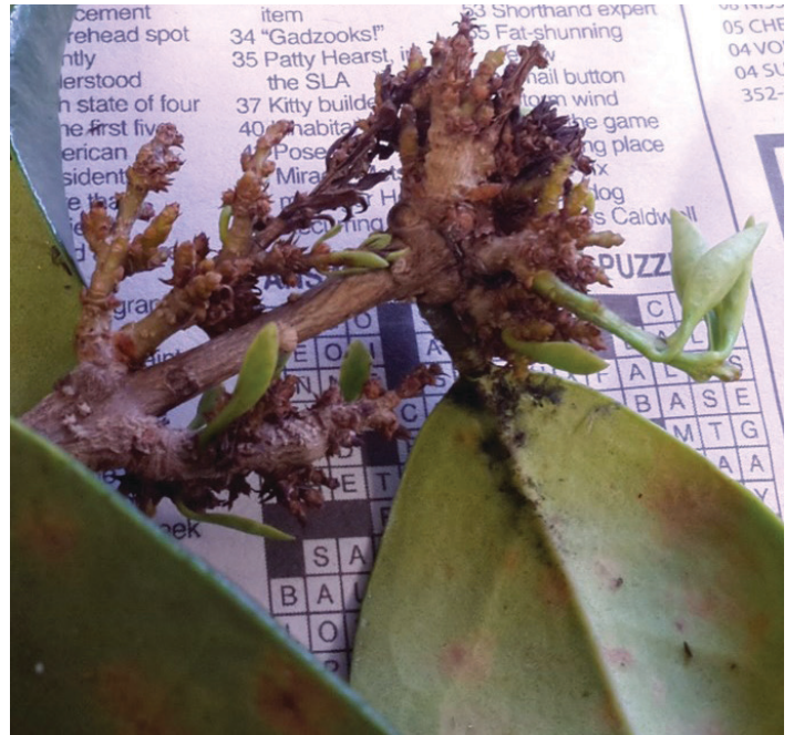
Figure 8. Bud proliferation on a ligustrum sample. Sphaeropsis tumefaciens was cultured from the stems of this sample. Sap-feeding insects were also observed and caused the sooty mold apparent in the photo.