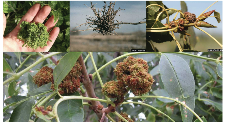
Figure 3. Characteristic galling damage to woody ornamentals caused by eriophyid mites. From top left to right, Aceria lantanae on lantana, Aceria celtis on hackberry, Eriophyes parapopuli on poplar, and Eriophyes fraxiniflora on ash.

found residing within the distorted plant tissue, although in some cases, they may be found farther down the plant stem where galling is not as severe. In Florida, between 2017 and 2020, the most commonly detected eriophyid mite species associated with galling damage was Aceria ligustri , a commonly found specialist on Ligustrum spp. trees and shrubs that is not known to cause damage. We may find A. ligustri most frequently because Ligustrum spp. are the most commonly submitted woody ornamentals with galling damage.