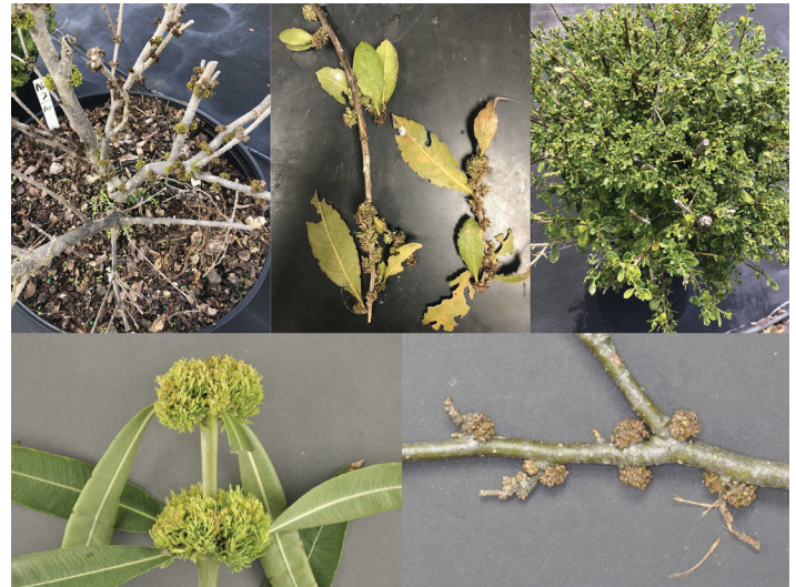
Figure 4. Damage caused by imazapyr exposure from herbicide applied to the soil near the base of the plant or in the root zone. Pictured clockwise, starting in the top left are canopy tissue from ligustrum, green buttonwood, dwarf Schillings holly, oleander, and linden.

pest control industry, the most commonly used commercial herbicides in this group include imazaquin (Scepter® T&O) and imazethapyr, which is a component of some herbicide mixtures such as Dismiss® South. There are also several homeowner products available at big-box retailers such as RoundUp® 365, Ortho Groundclear®, and others that may contain low concentrations of imazethapyr, imazapic, or imazapyr. Of all of these herbicides, imazaquin is the only herbicide that is labeled for use around the base of woody plants but can only be applied around ornamentals listed on the label. Products containing imidazolinone active ingredients can be very risky to use around the base of woody plants because they are root-absorbed and have a long half-life, meaning they can stay in the soil and remain available for uptake for several months. If woody plants are exposed to these compounds, they can exhibit severe damage, ranging from reduced leaf size, over-proliferation and stunting of buds, and severe growth inhibition (Figure 4).