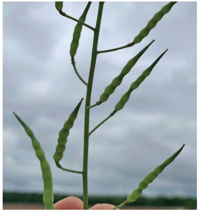
Figure 4. Wild radish (seedpod).