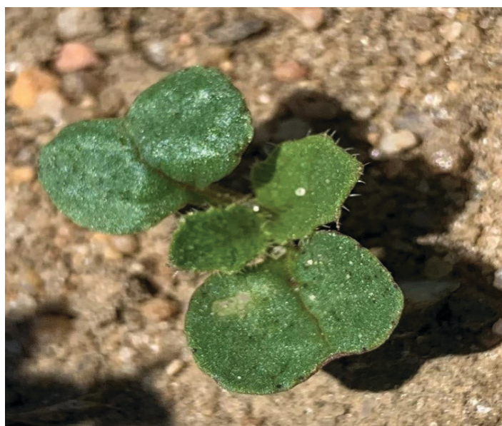
Figure 1. Wild radish (seedling with cotyledon).

true leaves are slightly serrated, indented, and about two to three times longer than their width. As the leaves mature, the serrations become more jagged and more deeply indented. Stiff hairs cover the leaves, giving them a bristly feel.