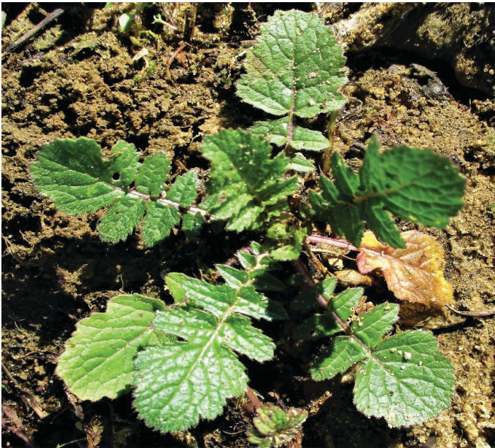
Figure 2. Wild radish (rosette). Credits: Pratap Devkota, UF/IFAS

The wild radish plant remains in rosette form through most of the winter, reaching approximately 10 to 14 inches across the base. As the temperature and day length increase in the late winter to early spring, the plant bolts (Figure 2). Bolting is a process in which the internodes (regions of the stem between leaves) begin to lengthen and a flower stalk forms at the top. In wild radish, multiple flower heads form on several branches arising from a single flower stalk. The flowers are generally yellow but occasionally may be white. Pods are slender and constricted between seeds, forming a notched appearance and giving the impression that multiple seed segments are joined (Figure 4). Each fruit pod produces about 4 to 9 seeds. Wild radish seedpods do not shatter (i.e., each seed section does not break up) as wild mustard seedpods do.