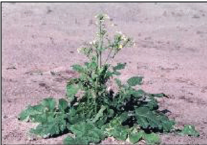
Figure 3. Wild radish (bolt).