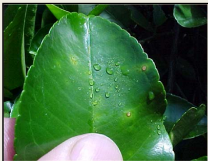
Cancro < 1 mes (superior)