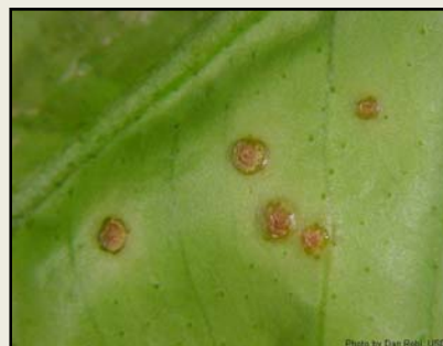
Cancro < 1 mes (inferior)