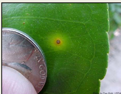
Cancro < 1 mes (superior)