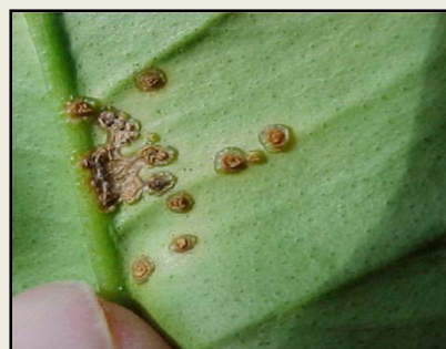
Cancro < 1 mes (inferior)