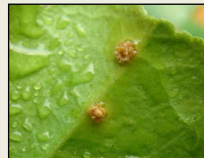
Cancro < 1 mes (inferior)