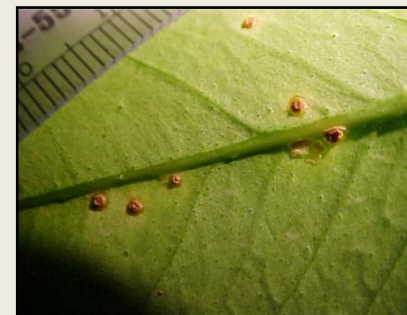
Cancro < 1 mes (inferior)