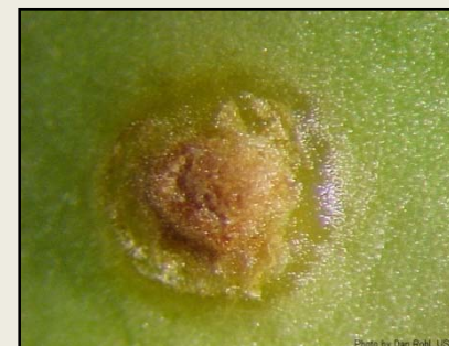
Cancro < 1 mes (inferior)