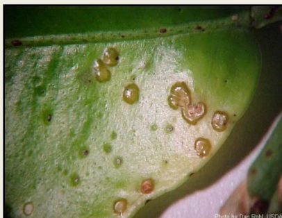
Cancro < 1 mes (inferior)