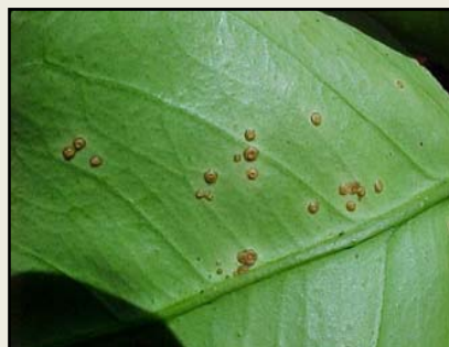
Cancro < 1 mes (inferior)