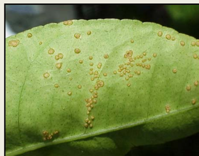
Cancro < 1 mes (inferior)