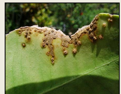
Múltiples lesiones en tejido dañado