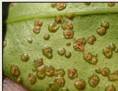
Cancro < 1 mes (inferior)