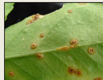
Cancro < 1 mes (inferior)