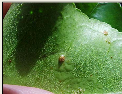
Cancro < 1 mes (inferior)