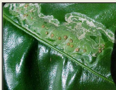
En galerías del minador de la hoja (superior)