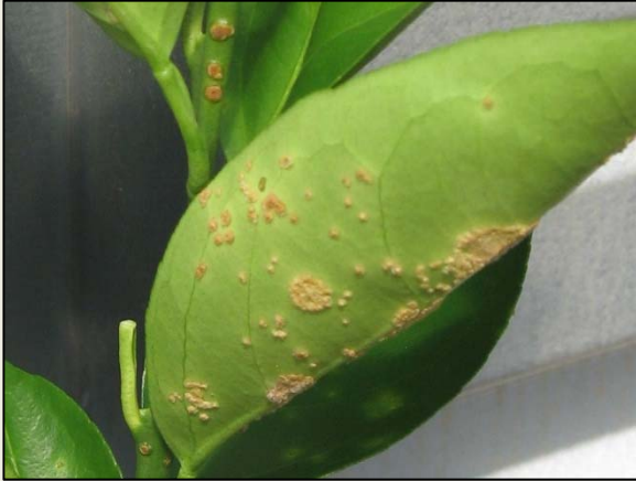
Cancro < 1 mes (inferior) (naranja dulce Hamlin)