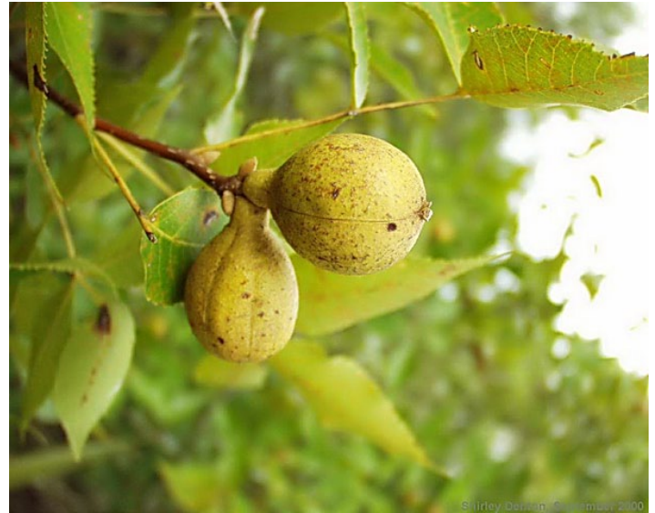
Figure 19. Carya floridana fruit.

Fruit: Dark brown to rusty-scaly nut, obovoid to oblong, 2.5–4 cm long (Figure 19). Husks rough, hard, and thin, approximately 2–3 mm thick.