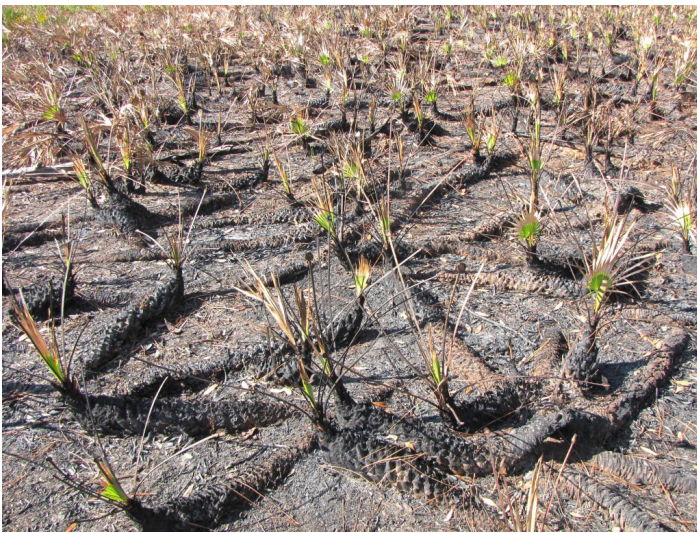
Figure 13. Serenoa repens commonly grows horizontally along the ground as shown here in this recently burned area.