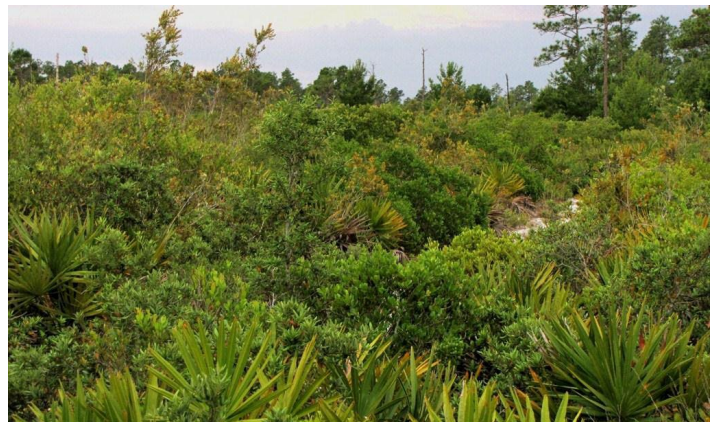
Figure 1. An example of a Florida scrub ecosystem.

An environmental constant that shaped the evolution of scrub ecosystems alongside water was fire. Fire continues to play an important role in maintaining the health and biodiversity of these habitats. The intervals between fire events in these habitats typically range from 5 to 30 years depending on the site conditions (e.g., soil type, water drainage) and scrub community (e.g., rosemary scrub, sand pine scrub). Fires generally top-kill woody shrubs (e.g., Lyonia spp.) and scrub oaks, which can re-sprout from underground root systems while other scrub plants (e.g., Pinus clausa , Ceratiola ericoides ) will be completely killed and regenerate from seed. Fire also reduces litter on the forest floor, increasing areas of open bare sand where many rare scrub plants occur. In the absence of fire, plant diversity will decrease over time because scrub communities tend to convert to a xeric hammock ecosystem.