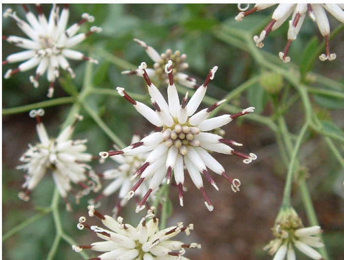
Figure 32. The flower on Palafoxia feayi is very distinctive.

Leaves: Oblong, ovate, lanceolate, to narrowly elliptic, 2–7 cm long. Margins entire, apex acute to obtuse, base rounded (Figure 31). Texture rough to the touch.