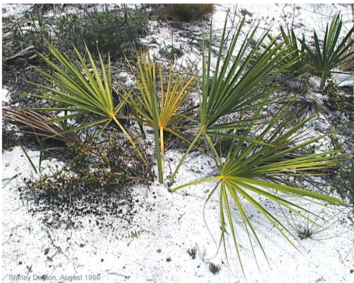
Figure 10. The stems occur underground on Sabal etonia .

Form: Perennial. Height commonly 1 m. Contorted or “S”-shaped subterranean stems . Bud is generally below ground (Figure 10).