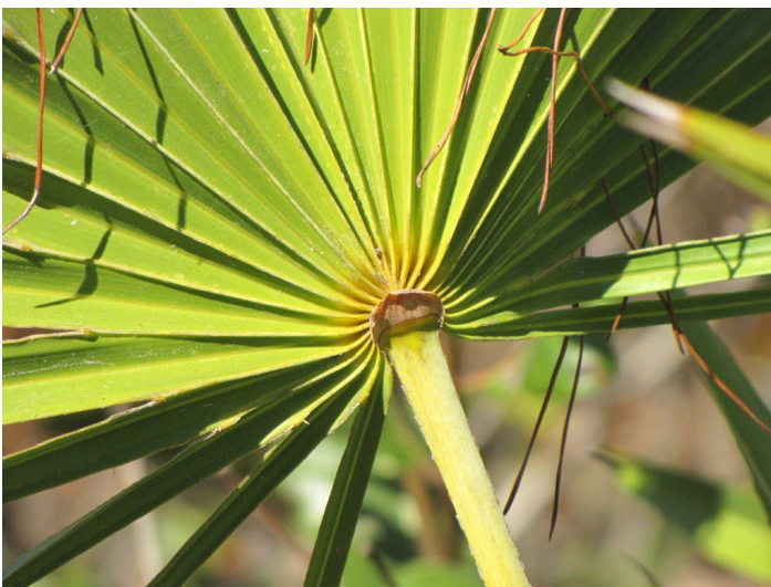
Figure 15. The hastula of Serenoa repens is slightly rounded, unlike that of Sabal etonia . In addition, the leaf is palmate, unlike the costapalmate characteristic of Sabal etonia .