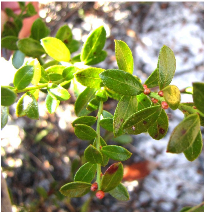
Figure 34. The upper surface of the leaves of Vaccinium myrsinites are shiny, with minute, gland-tipped, ascending teeth that give the margins a somewhat crenate or scalloped appearance.