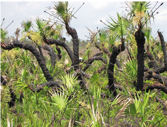
Figure 14. Serenoa repens can grow vertically up to 7 meters in height if fire is suppressed as shown here.