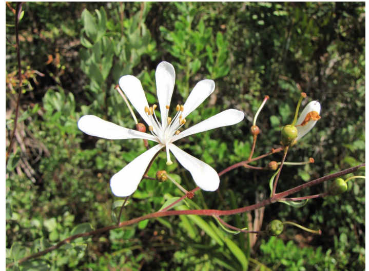
Figure 16. Bejaria racemosa has 7 separated petals and a persistent pistil on the capsule as shown here.