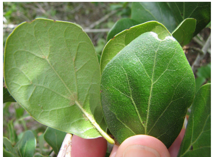
Figure 9. Quercus myrtifolia is less than twice as long as it is wide. The shiny upper and lower surface of the leaves are apparent. The lower surface will become shinier as hairs shed.

Form: Tardily deciduous shrub to 11 m. Typically forms thickets. Branches are usually crooked. Forms thickets by spreading via subterranean runners.