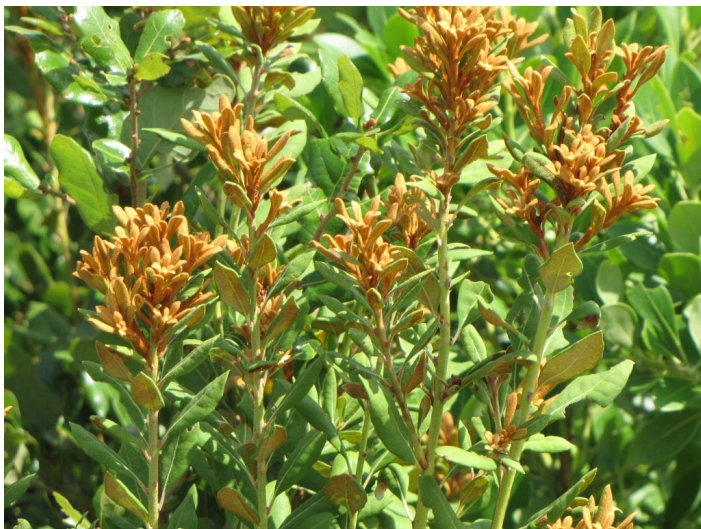
Figure 25. Rusty scales and pubescence can be seen covering the surfaces of Lyonia ferruginea , especially on new growth. Older vegetation does not have as many scales or hairs as they slough with age, and leaf margins are revolute at maturity.