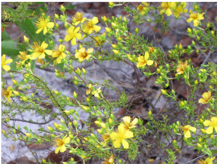
Figure 22. The leaves of the Hypericum tenuifolium are small and needle-like. The flowers are yellow with 5 petals.