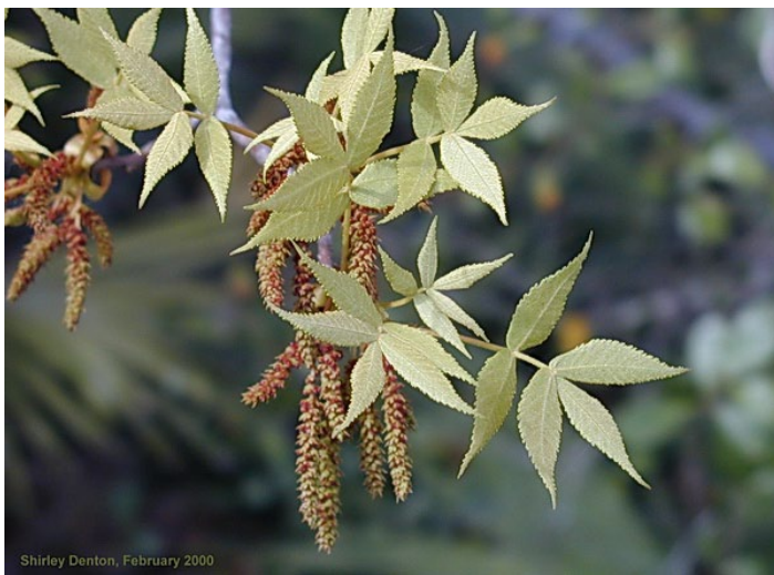
Figure 18. Leaves and flowers of Carya floridana .

Form: Deciduous, commonly a shrub to 5 m tall, but can reach up to 25 m tall. Multi-trunked.