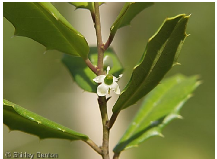
Figure 23. The flowers of Ilex opaca var. arenicola are cream to white and 4-lobed.