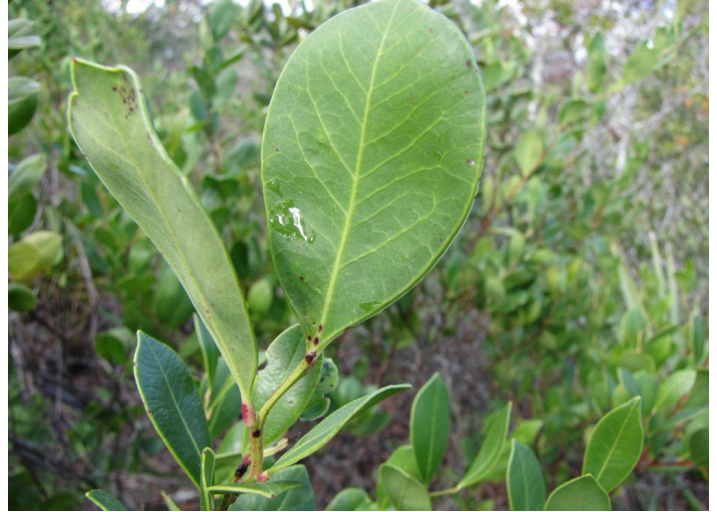
Figure 29. This figure shows the yellow to yellowish-green intramarginal vein that runs parallel to the leaf margin in Lyonia lucida . This is a key characteristic for this species.

Leaves: Simple, alternate, leathery. Commonly broadly elliptic , otherwise oval to obovate. 2–8 cm long, 1–4 cm wide. Upper surface glossy, glabrous , dark green, sparsely punctate dotted. Lower surface paler with a greater number of purple to brown punctate dots. Margins entire to slightly revolute with a yellow to yellow-green intramarginal vein running closely alongside the margins (Figure 29). Apex acute to minutely acuminate. Base cuneate.