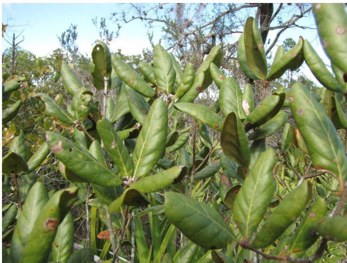
Figure 8. Quercus inopina leaves are held vertically on the plant. The leaves are heavily revolute and twice as long as they are wide.

Form: Evergreen shrub to 5 m, but usually 1–1.5 m tall. Forms thickets by spreading via subterranean runners. Leaves commonly held “vertically” on plant due to twisted petioles.