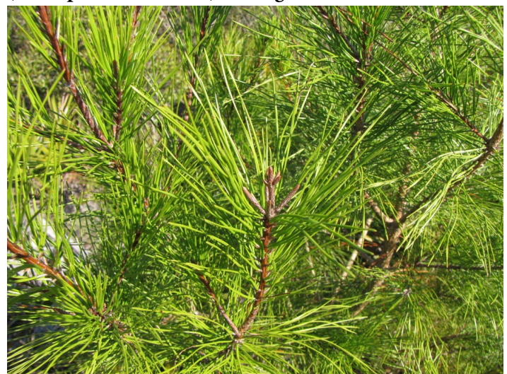
Figure 4. Close-up of Pinus clausa showing the short and twisted characteristic of its needles.

Stem: Grayish and scaly or smooth (towards top of trunk or new growth) turning plate-like and reddish brown (lower portion of trunk) with age.