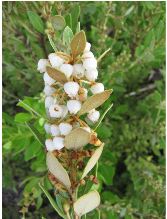
Figure 26. The flowers of Lyonia ferruginea and Lyonia fruticosa are urceolate.

Flowers: Spring. White clusters borne in axils of branches and twigs of previous season. Urceolate (Figure 26).