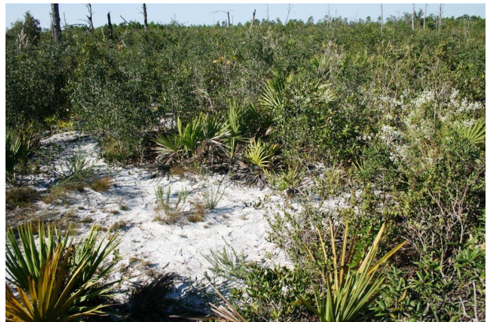
Figure 2. Areas of open, bare sand are common in a fire-maintained scrub ecosystem.