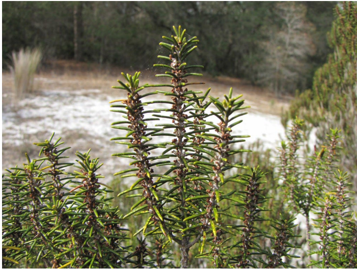
Figure 21. The leaves of Ceratiola ericoides appear whorled, but are in fact opposite. The flowers seen here are borne in the axils of the leaves.

Leaves: Simple, appear whorled but are opposite . Needle-like , commonly 8–12 mm long, 1 mm wide (Figure 21). Aromatic.