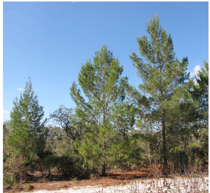
Figure 3. Pinus clausa .

Form: Evergreen tree up to 25 m tall but usually 8–14 m (Figure 3). Diameter at breast height (DBH) up to 51 cm. Branches are dense, commonly droop, and are often not self-pruned (lower branches persistent) . Cones are persistent.