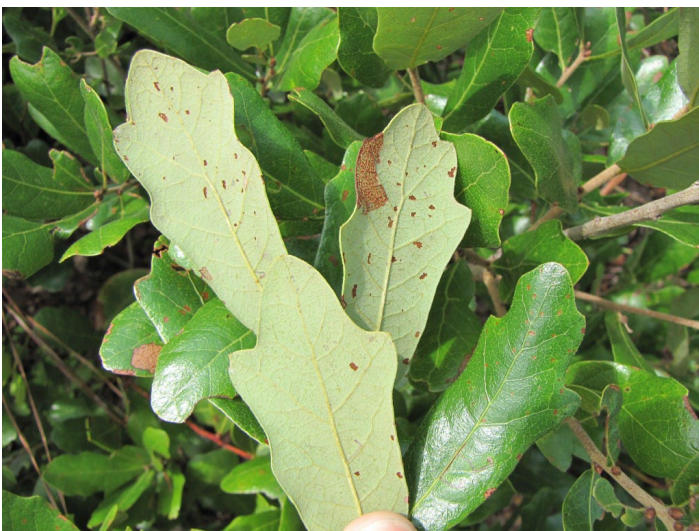
Figure 6. Quercus chapmanii leaves showing the shiny upper surface and grayish-dull lower surface.