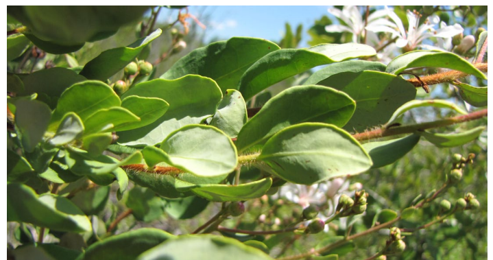
Figure 17. Close up of the leaves and hairy stems of Bejaria racemosa .