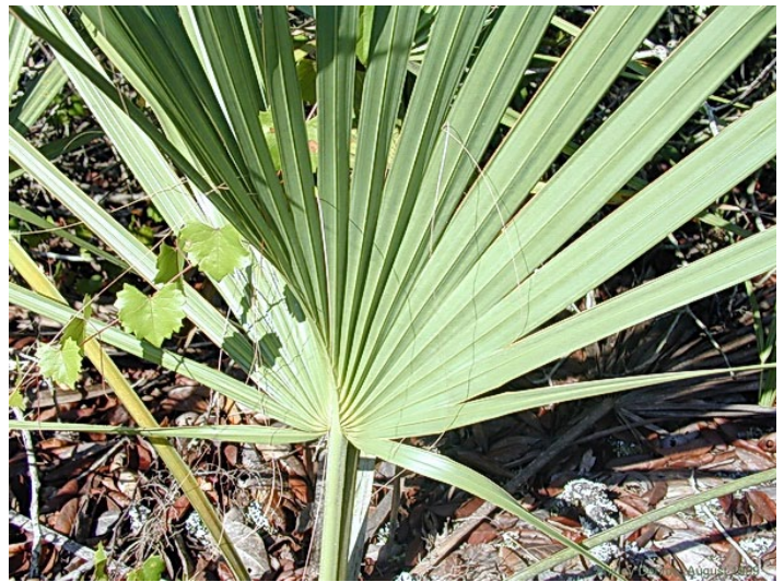
Figure 11. Leaves of the Sabal etonia showing the costapalmate characteristic.

Leaves: Costapalmate , approximately 1 m long (Figure 11). Usually 3–5 leaves present at a time. Petioles 25–40 cm long, up to 2 cm wide, margins smooth (without prickles) and arch upwards. The triangular hastula extends past the base of the leaf giving the leaf a “folded” appearance . The hastula is 1.2–4 cm long and triangular. Fibers occur between leaf blade segments , green to yellowish-green.