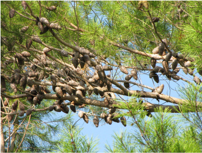
Figure 5. The cones of Pinus clausa are typically persistent on the branches.

Reproduction: Pollen cones appear in early spring. Monoecious, inconspicuous. Males: yellow, long, and slender. Females: purple to yellow. Seed cones usually clustered, 2–10 cm long, brown; spines are short and stout; serotinous ( Pinus clausa var. clausa ) or non-serotinous ( Pinus clausa var. immuginata ) depending on variety; typically persistent on branches (Figure 5).