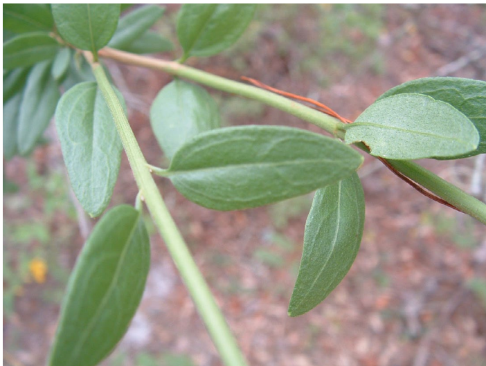
Figure 31. Palafoxia feayi leaves.