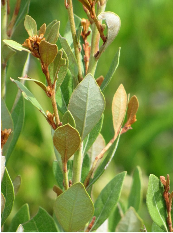
Figure 27. Lyonia fruticosa leaves are curved upwards at maturity, whereas Lyonia ferruginea are revolute.

Distinguishing characteristics: Lyonia fruticosa is very similar to L. ferruginea and both species are often found growing together. L. fruticosa , however, has scales on the lower leaf surface in just one size, whereas L. ferruginea has scales in two sizes. The surfaces of the leaves on L. fruticosa turn dull gray with age, leaf edges curve slightly upwards (Figure 27), and veins are not impressed on the upper surface.