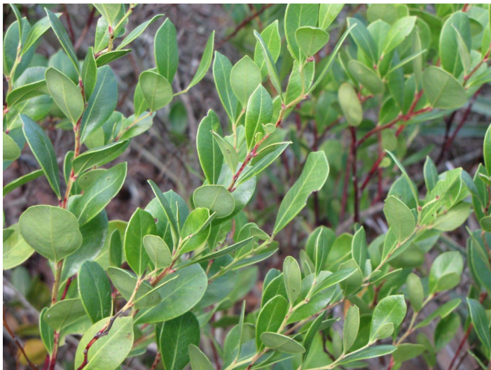
Figure 28. Lyonia lucida .