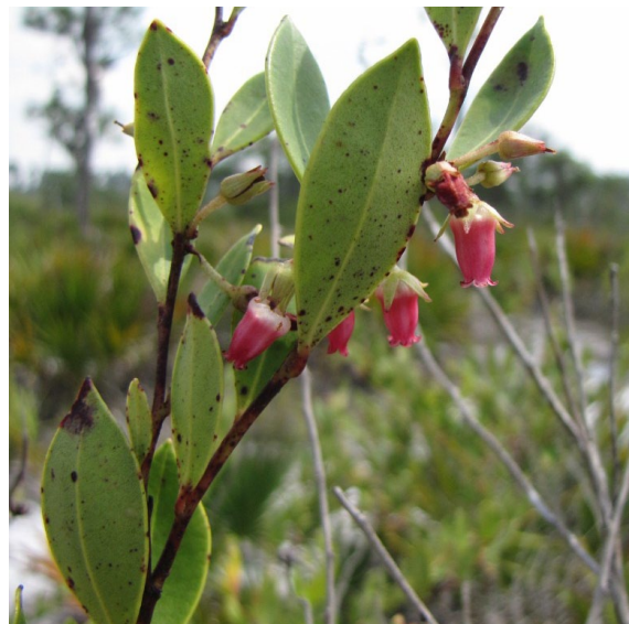
Figure 30. The flowers of Lyonia lucida are reddish to white and are urceolate in shape.