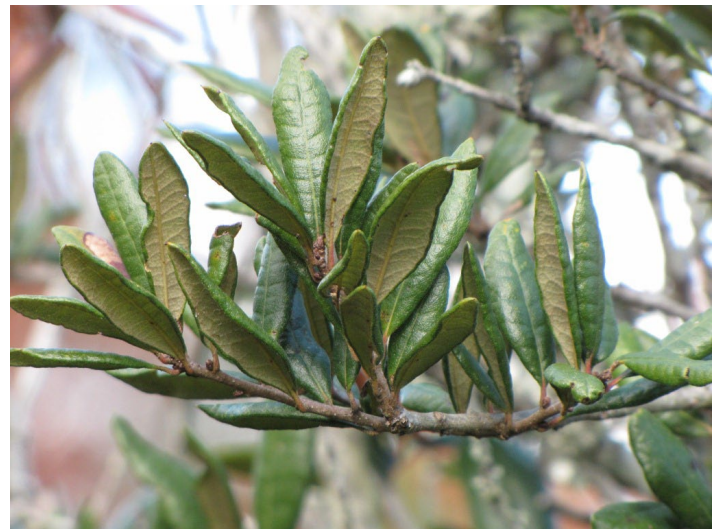
Figure 7. Quercus geminata leaves showing the shiny upper surface, tan pubescent lower surface, and strongly revolute margins.