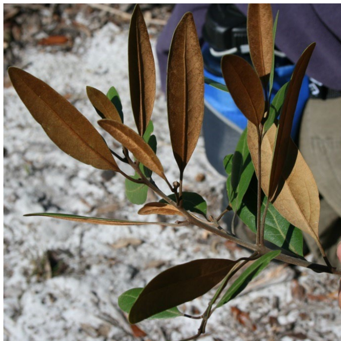
Figure 33. A silky, brown pubescence is evident on newer growth of Persea borbonia var. humilis .