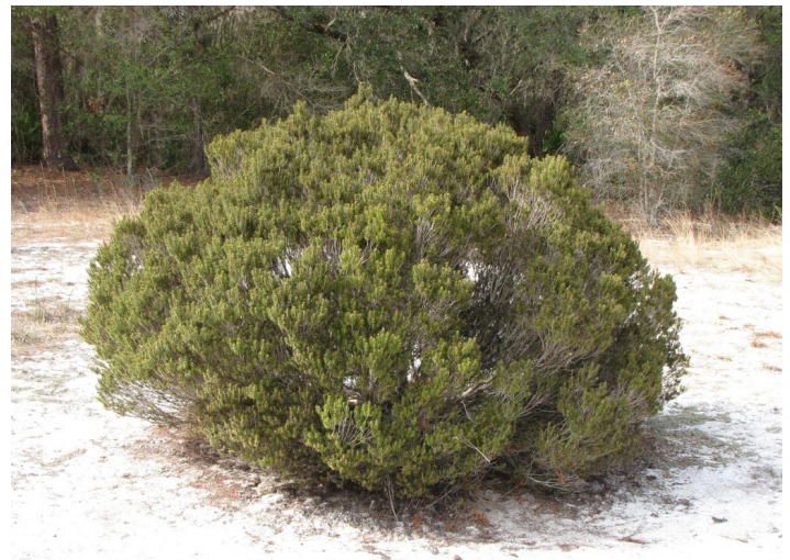
Figure 20. Ceratiola ericoides grows in a bushy, mound-like, or round form.

Form: Evergreen shrub, erect, bushy-branched, mound-like or round , to 3 m tall (Figure 20).