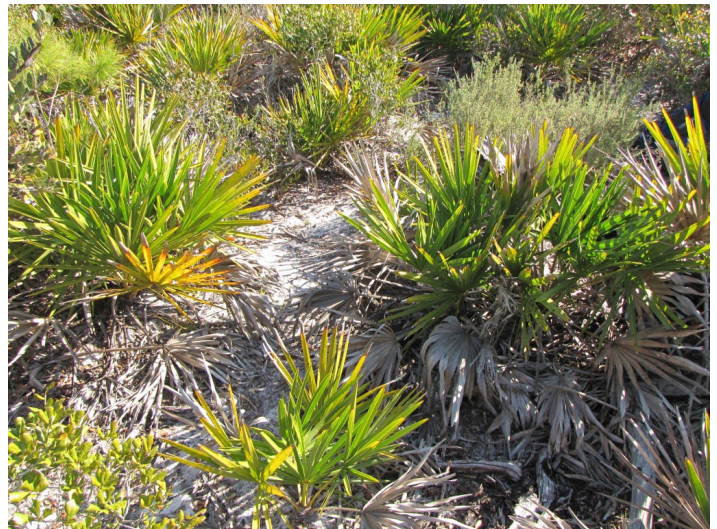
Figure 12. Serenoa repens in scrub ecosystems.

Form: Perennial, capable of reaching 7 m in height, but commonly grows horizontally along the ground or just below the ground . Stems can lean, creep, or grow erect (Figure 12 to Figure 14). Can form large thickets.