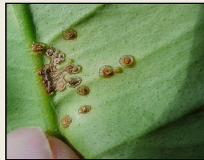
Canker < 1 month old (bottom)