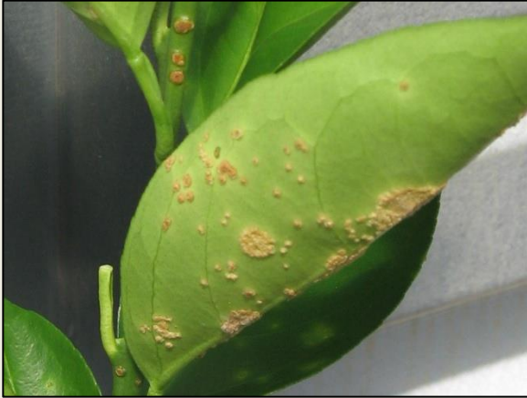
Canker < 1 month old (bottom) (Hamlin sweet orange)