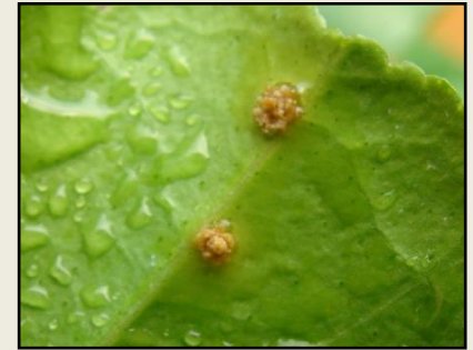
Canker < 1 month old (bottom)