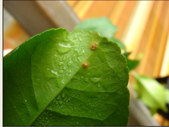
Canker < 1 month old (bottom) (Hamlin sweet orange)