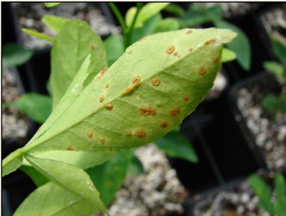
Canker < 1 month old (bottom) (Swingle citrumelo)