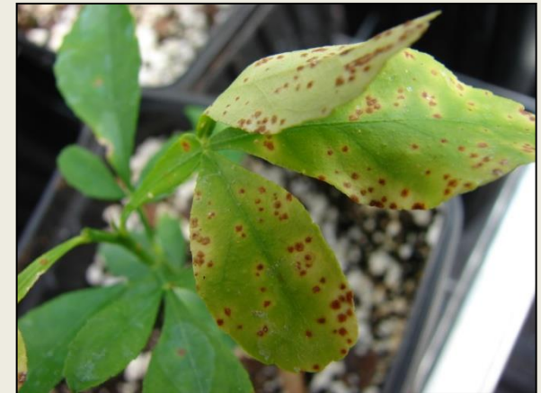
Canker < 1 month old (top) (Swingle citrumelo)