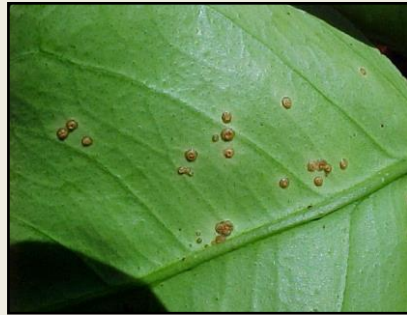
Canker < 1 month old (bottom)