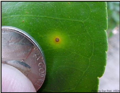
Canker < 1 month old (top)