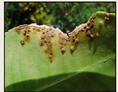
Multiple lesions on injured tissue