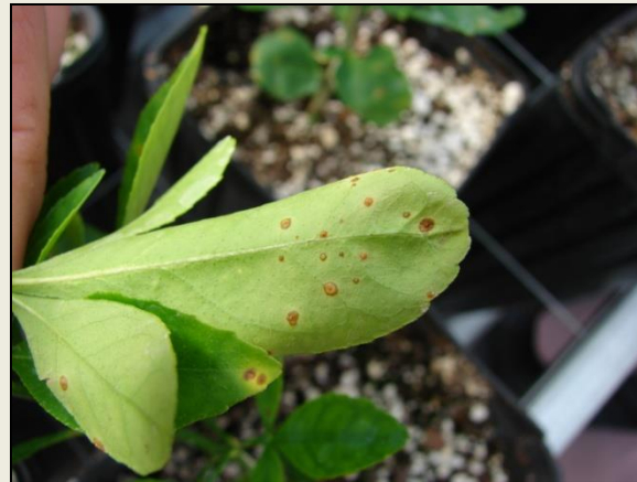
Canker < 1 month old (bottom) (Swingle citrumelo)