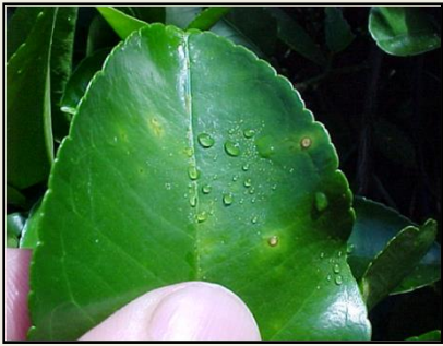
Canker < 1 month old (top)