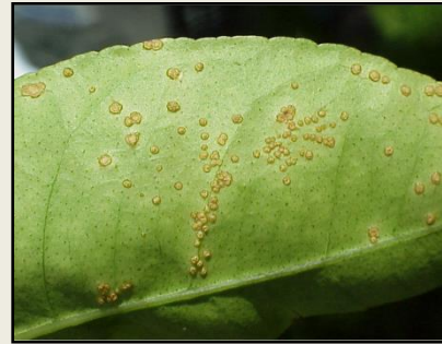
Canker < 1 month old (bottom)