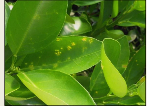
Canker < 1 month old (top) (Hamlin sweet orange)