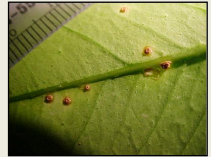
Canker < 1 month old (bottom)