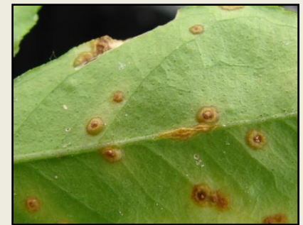
Canker < 1 month old (bottom)