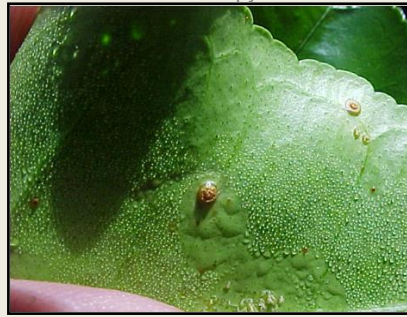
Canker < 1 month old (bottom)