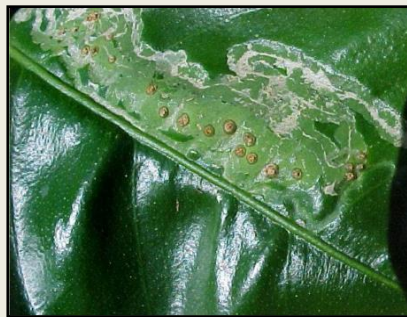
Canker in leaf minor gallery (top)