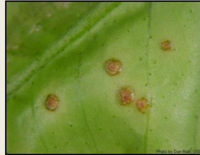
Canker < 1 month old (bottom)