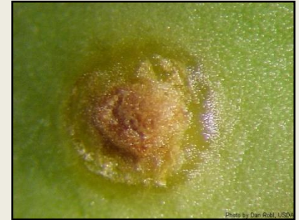
Canker < 1 month old (bottom)