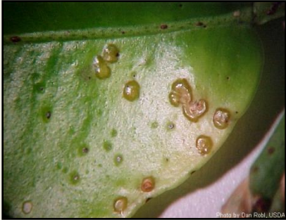
Canker < 1 month old (bottom)