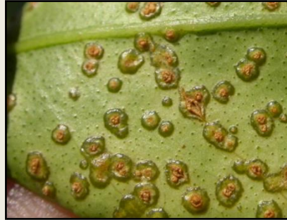
Canker < 1 month old (bottom)